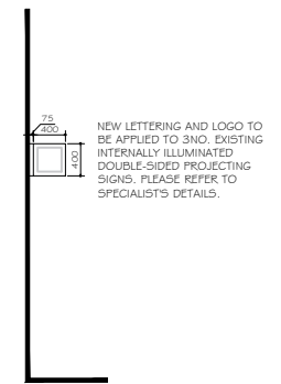
PROPOSED TYPICAL PROJECTING SIGN SIDE ELEVATION SCALE 1:50@A1