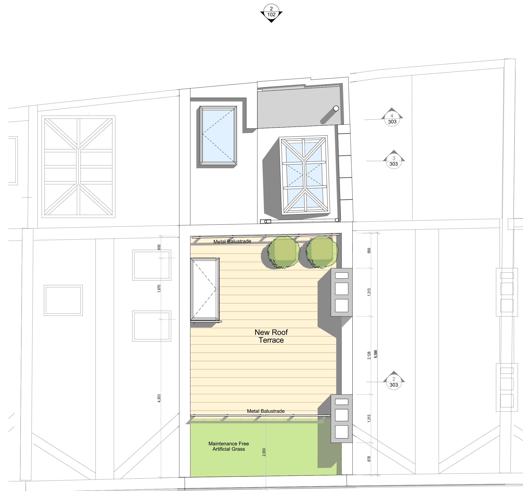
3 Proposed Roof SCALE 1:50