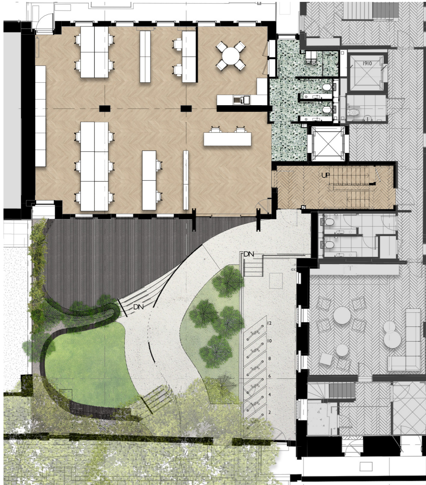
Floor Plan | Lower Ground