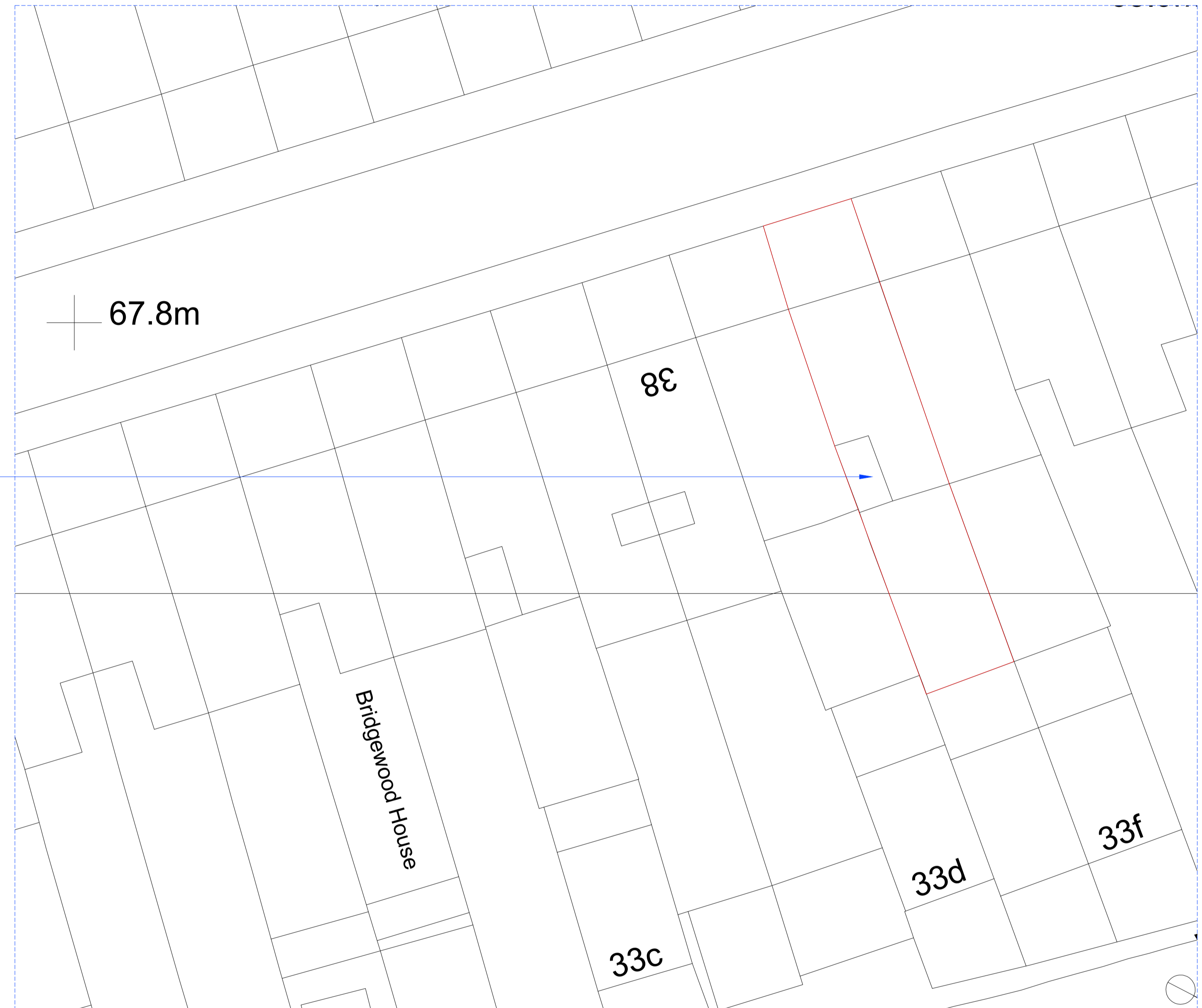
00 1:200@A1 PROPOSED BLOCK PLAN 0 2.5 5 10m