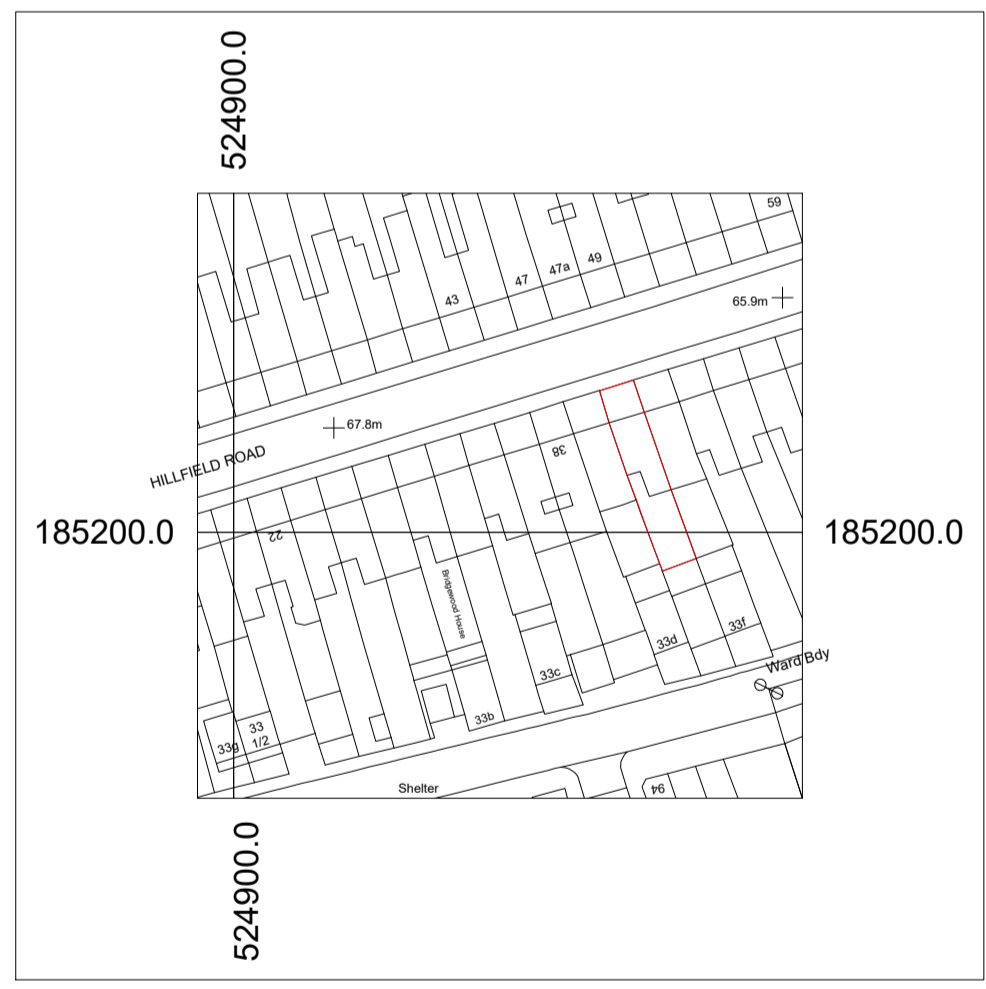
OS 1:1250@A1 EXISTING LOCATION PLAN 0 10 20 50m

Approximate location for new proposed rear single storey extension