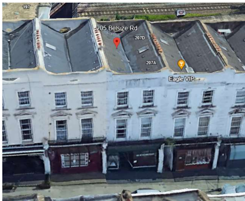
Photo 1 - Front Elevation

2.2 The property features a commercial property to the ground floor with residential above. The external walls are rendered to all elevations, with timber single glazed windows and an inverted London roof.