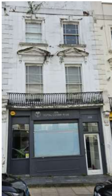
Photo 1 - Front Elevation