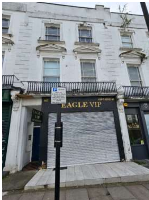
Photo 1 - Front Elevation

2.2 The property features a commercial property to the ground floor with residential above. The external walls are rendered to all elevations, with timber single glazed windows and an inverted London roof.