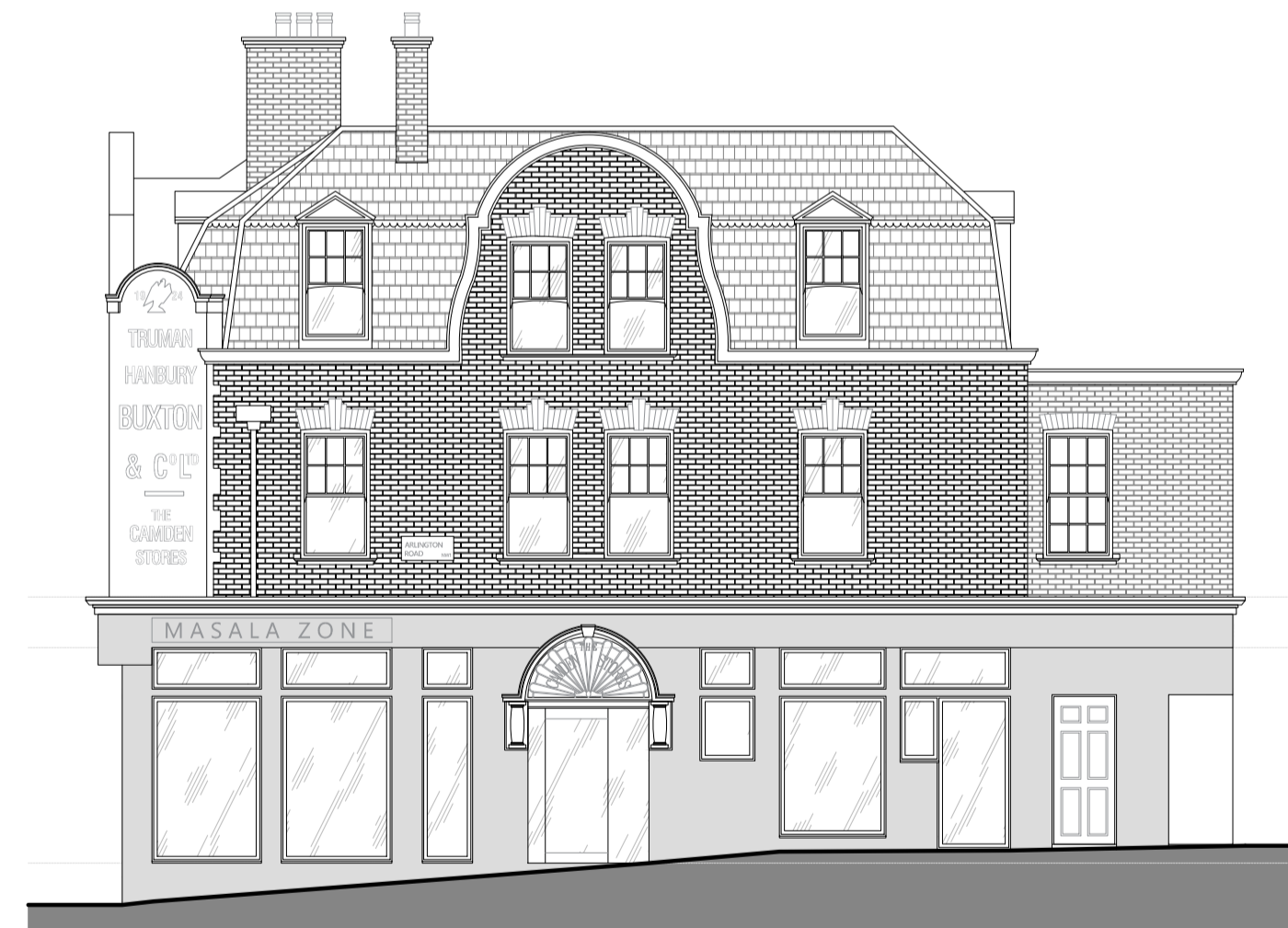
EXISTING ELEVATION - SIDE I (SCALE 1:100)