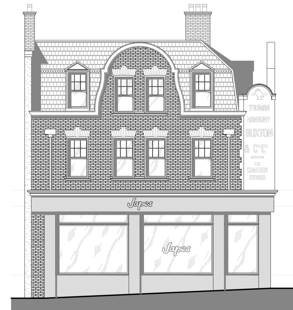
PROPOSED ELEVATION - FRONT (SCALE 1:100)