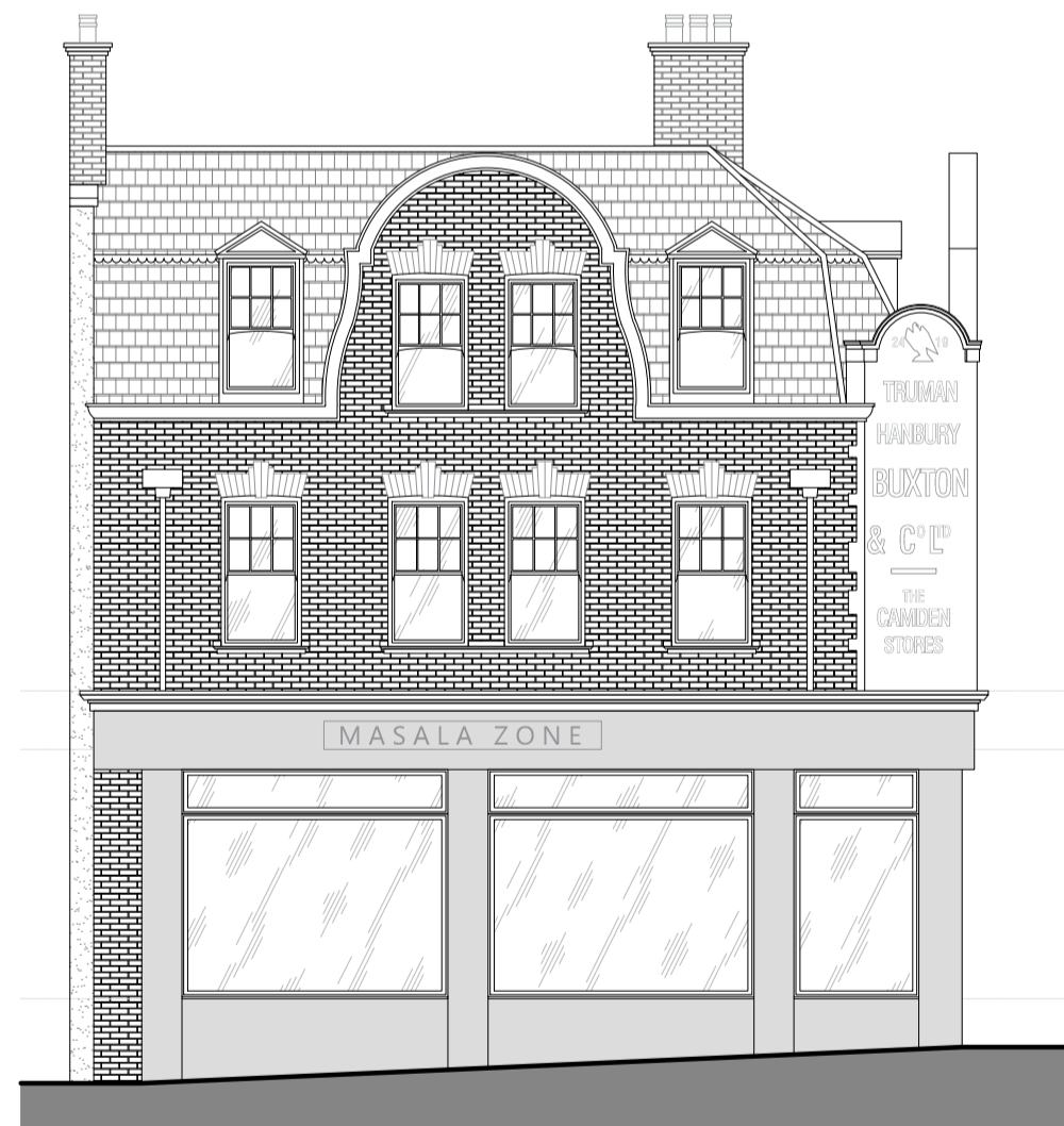
EXISTING ELEVATION - FRONT (SCALE 1:100)