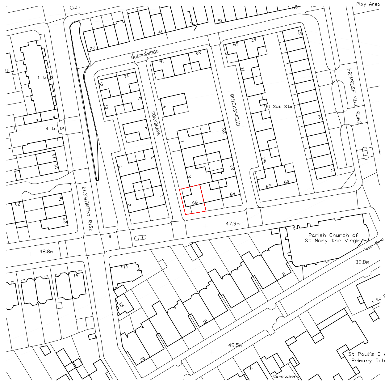
1 SITE LOCATION PLAN 1 : 1250

THIS DRAWING AND ANY DESIGNS INDICATED THEREON ARE THE COPYRIGHT OF THE ARCHITECT. ALL RIGHTS ARE RESERVED. NO PART OF THIS WORK MAY BE REPRODUCED WITHOUT PRIOR PERMISSION IN WRITING FROM THE ARCHITECT.