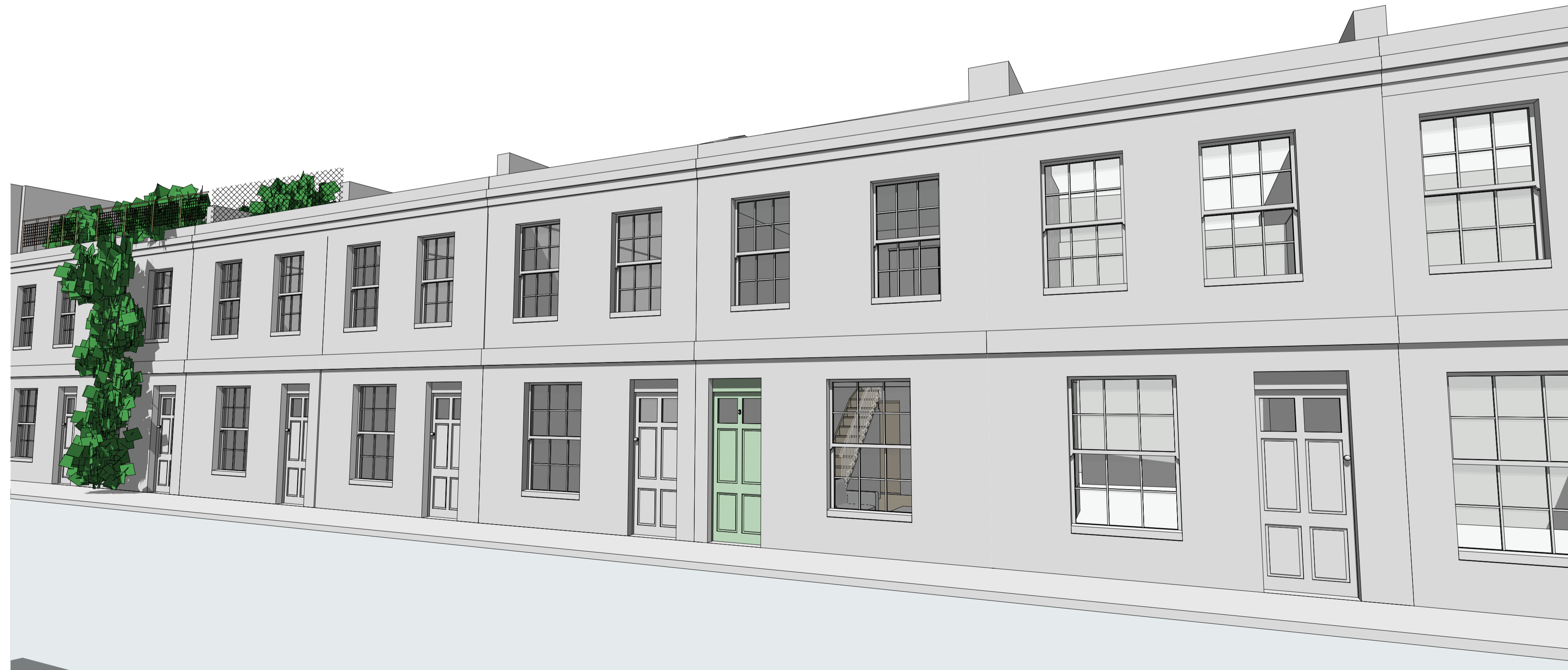
3 Proposed Street View