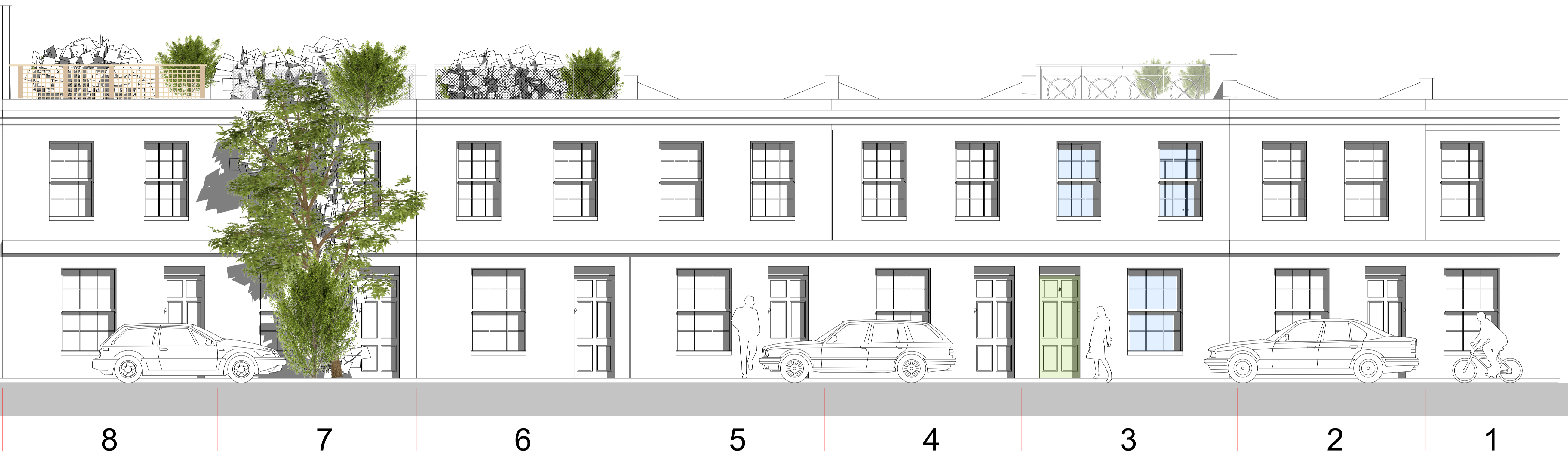
1 Proposed Street Elevation SCALE 1:50