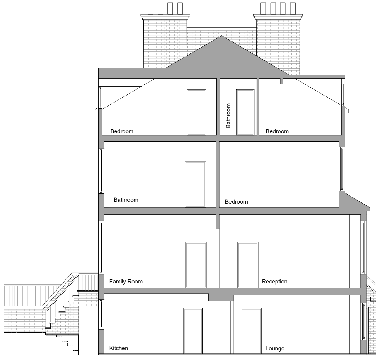
01 Existing Section 1:100 @ A3