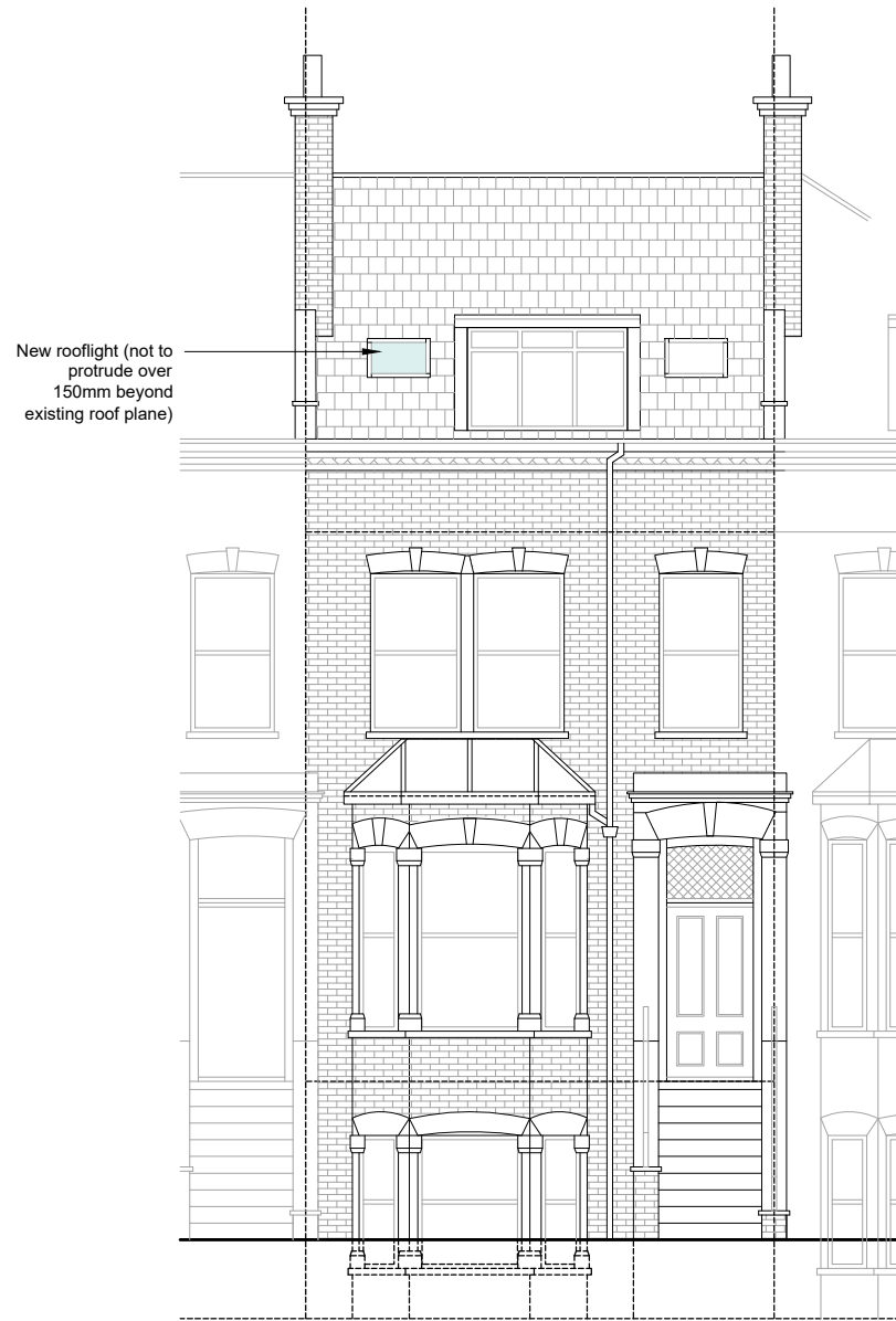
01 Proposed Front Elevation (No change) 1:100 @ A3