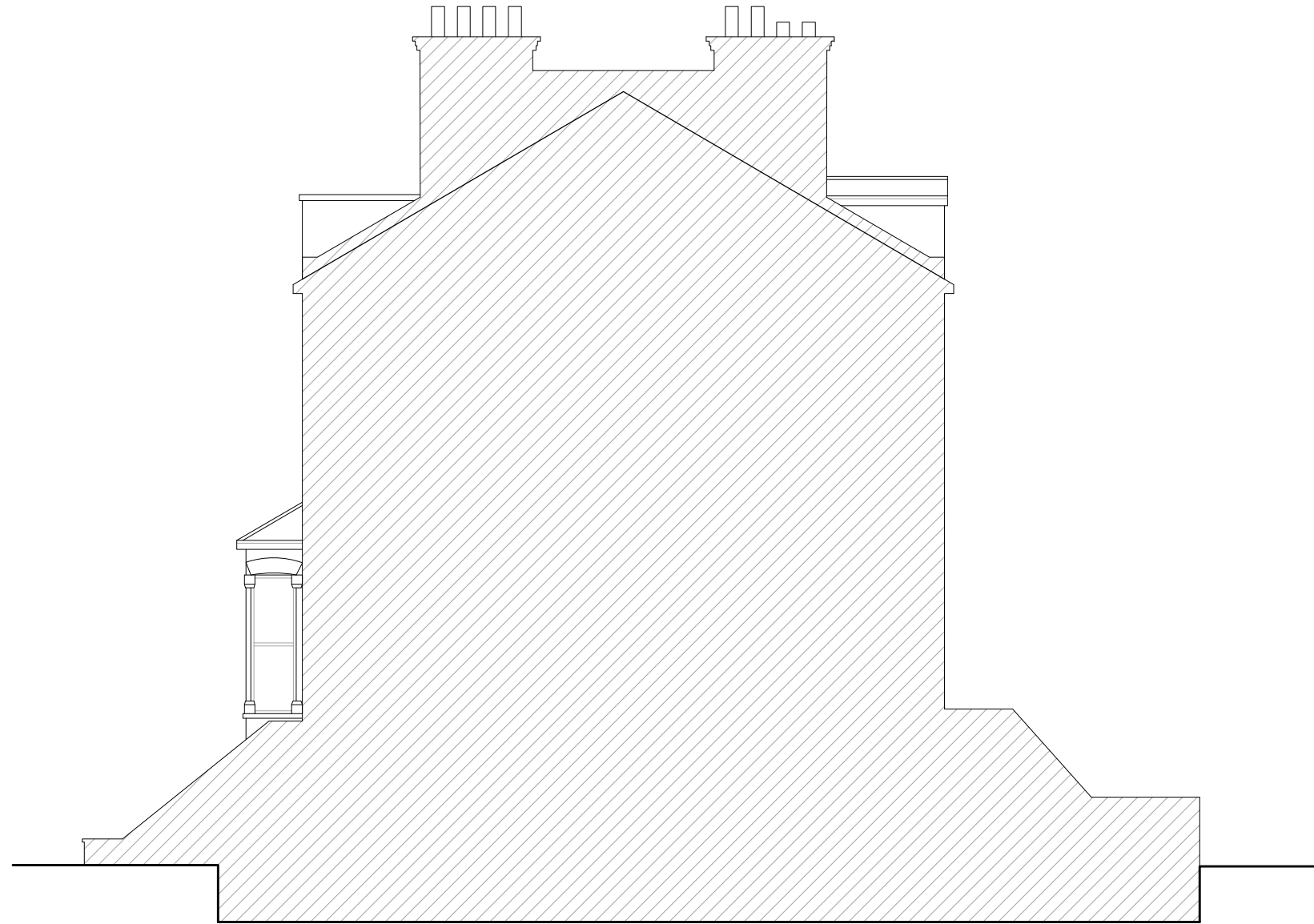
02 Existing Side Elevation 1:100 @ A3