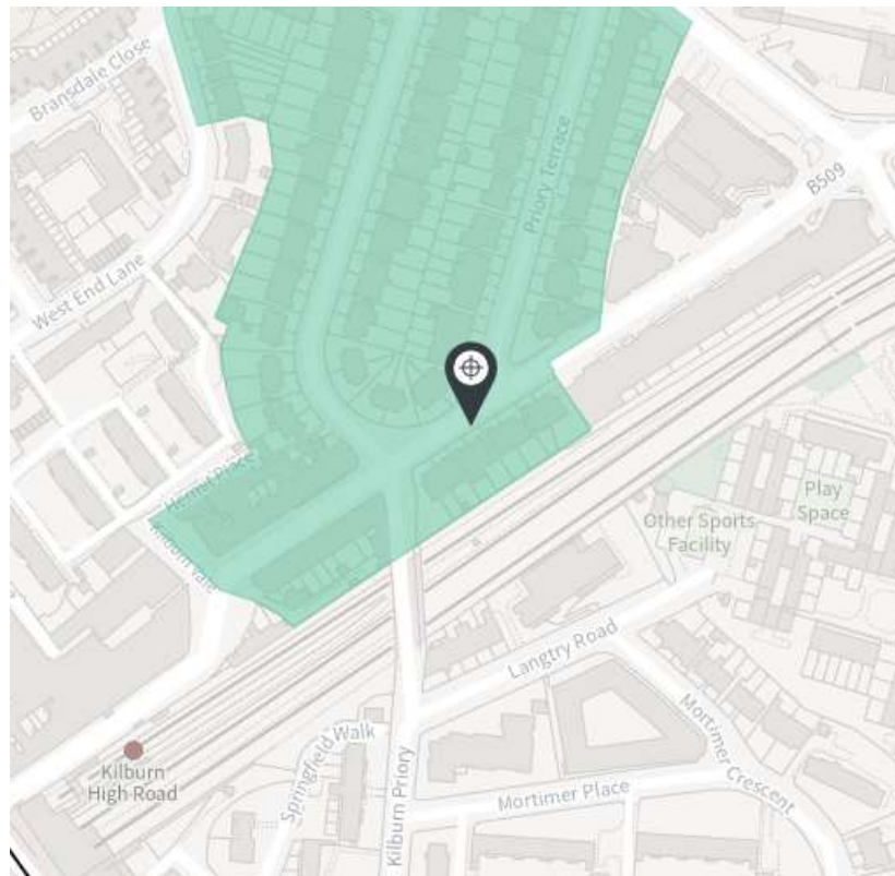
Diagram 1 – Planning Map