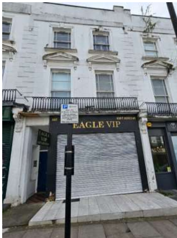
Photo 1 - Front Elevation

2.2 The property features a commercial property to the ground floor with residential above. The external walls are rendered to all elevations, with timber single glazed windows and an inverted London roof.