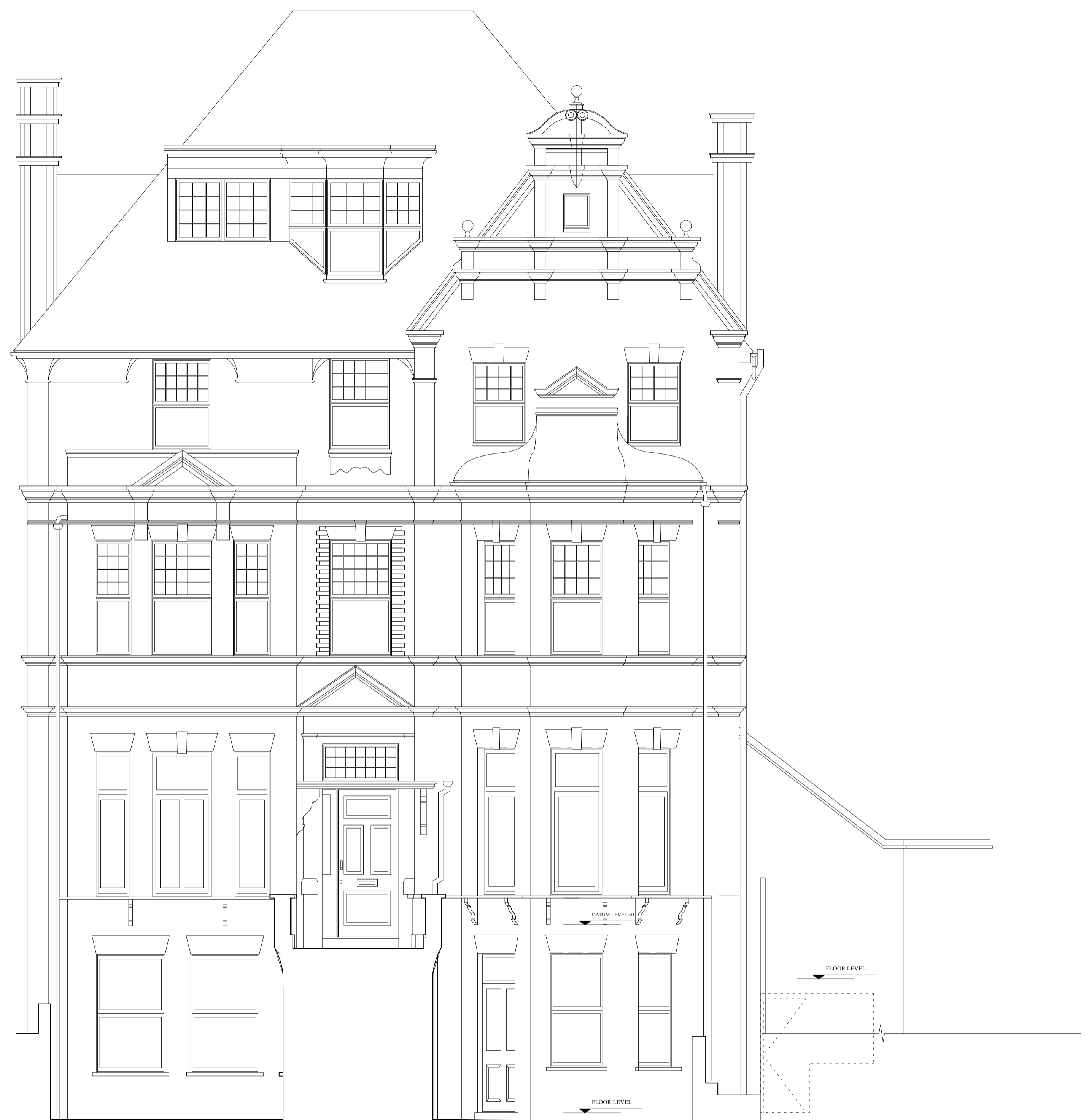
1 Existing West Elevation Scale: 1:100