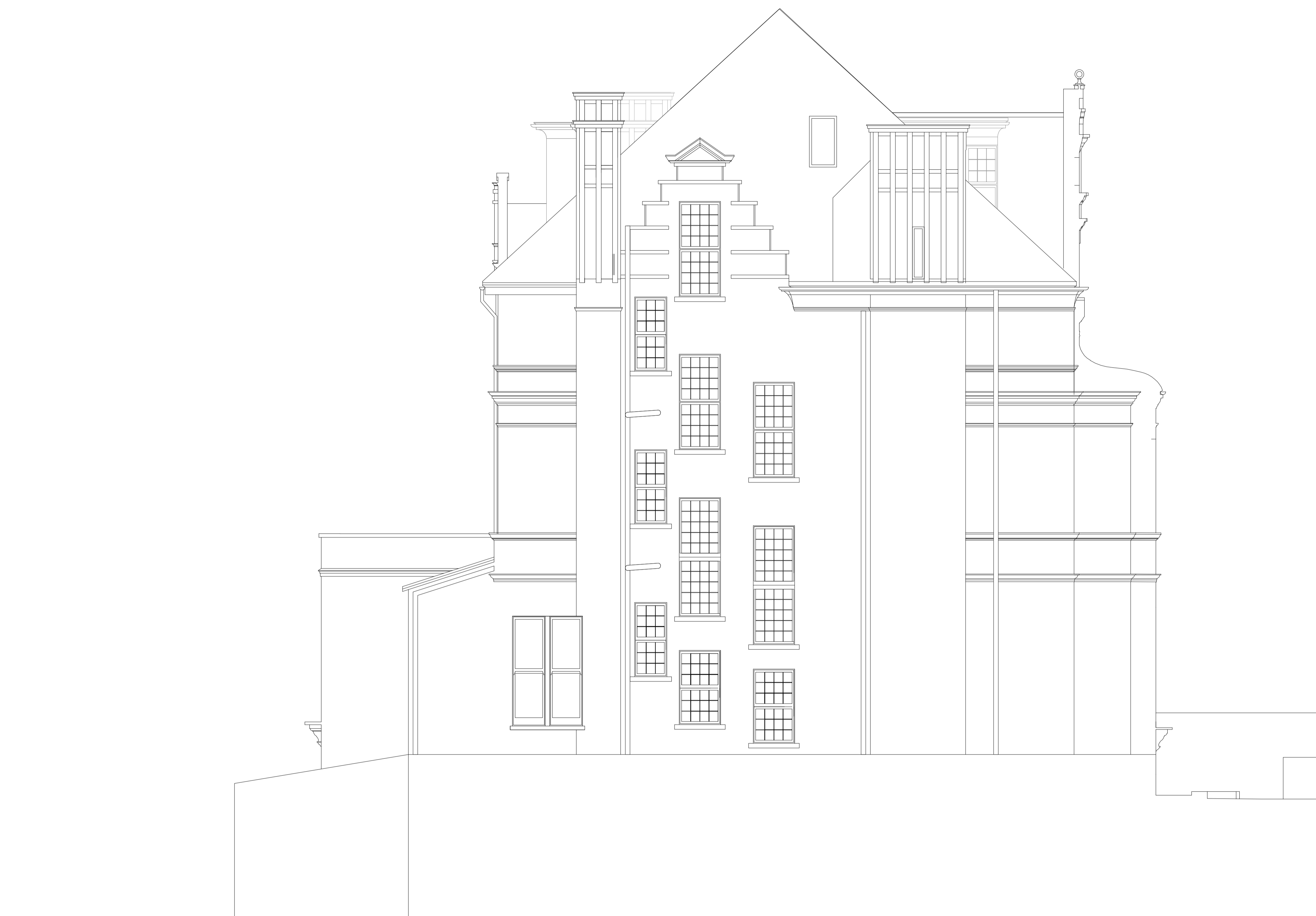
1 Existing North Elevation Scale: 1:100