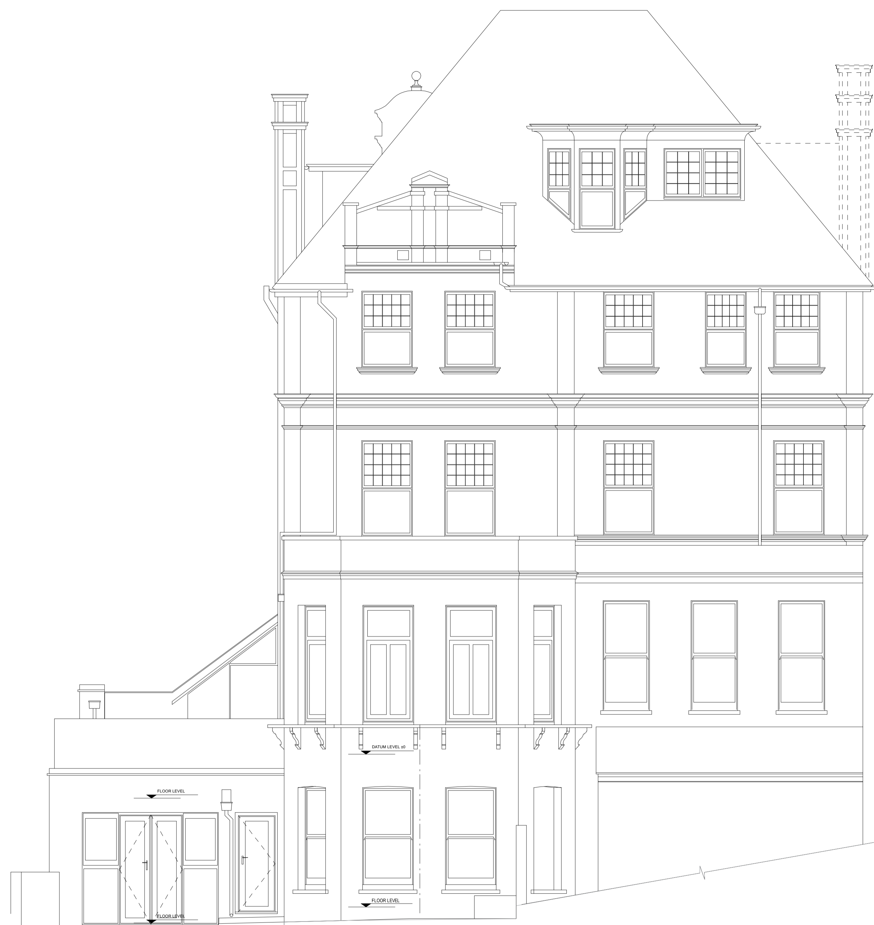
1 Existing East Elevation Scale: 1:100