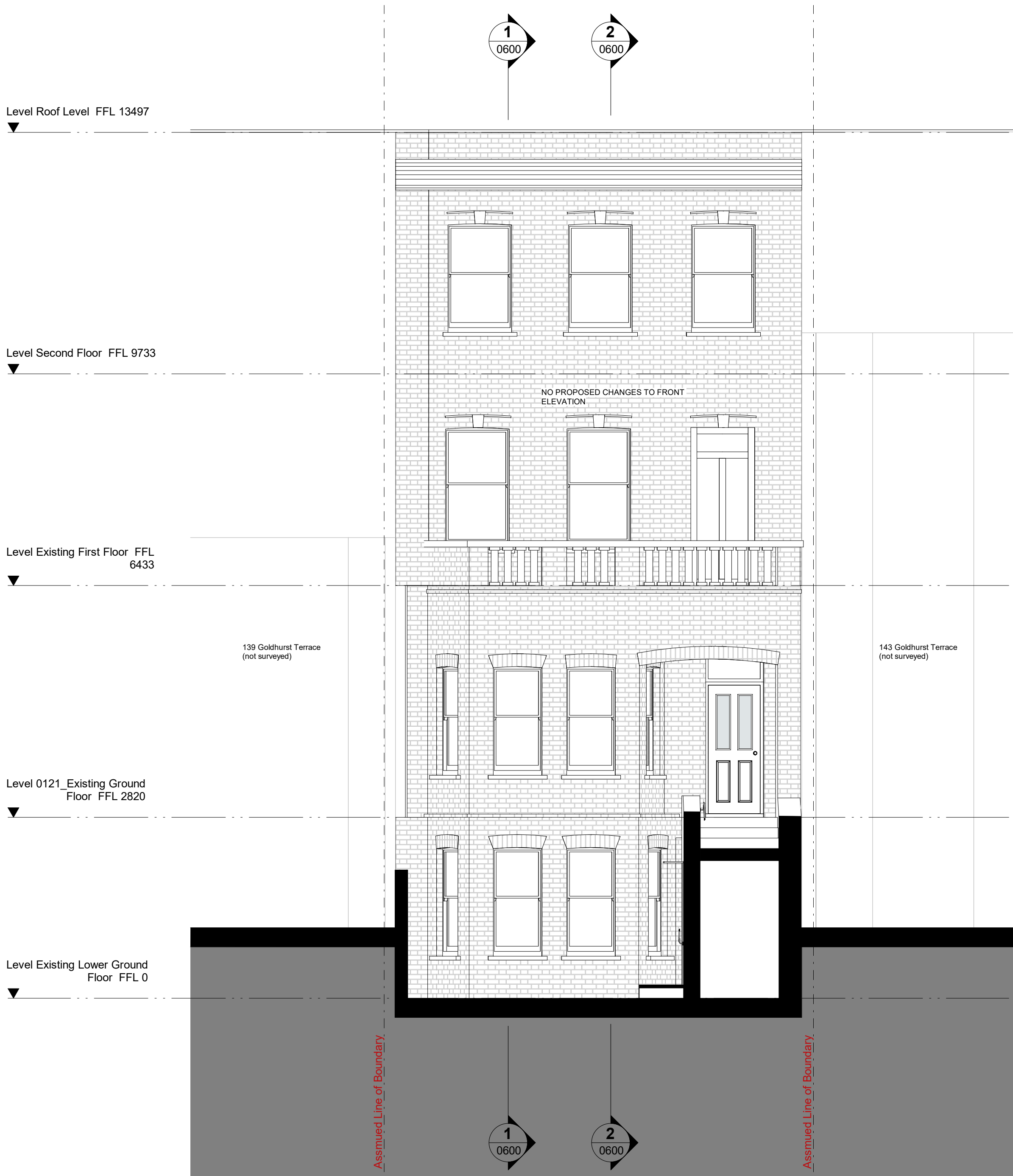
1 Proposed Front Elevation Scale - 1 : 50

Areas - the areas provided on drawings are rounded to the nearest whole unit. Measurements are based upon received survey information and as such a reasonable allowance should be made for discrepancies or deviations that may occur during construction.