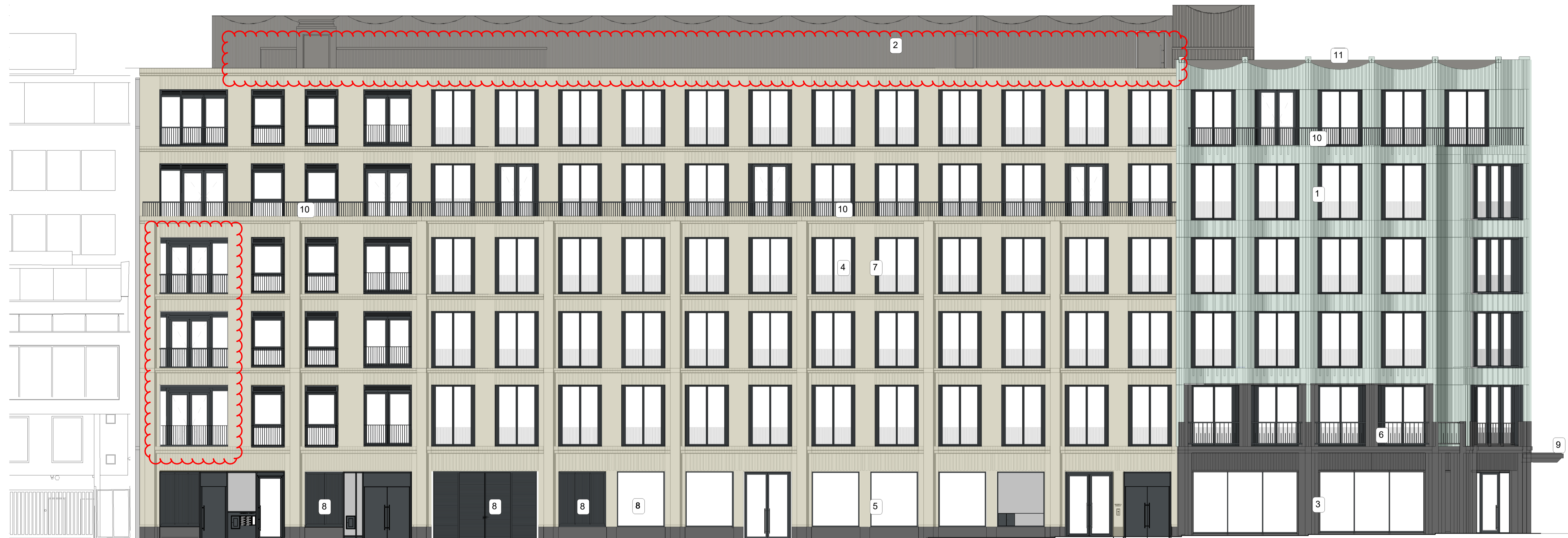
BRICK FACADE RESIDENCES DETAILS GROUND FLOOR LOUVRE SCREEN & SHARED ENTRANCE GROUND FLOOR LOUVRE SCREEN UKPN DETAILS GROUND FLOOR VENT DETAILS BRICK FACADE OFFICE DETAILS GROUND FLOOR FIRE ESCAPE & CYCLE STORE ENTRANCE