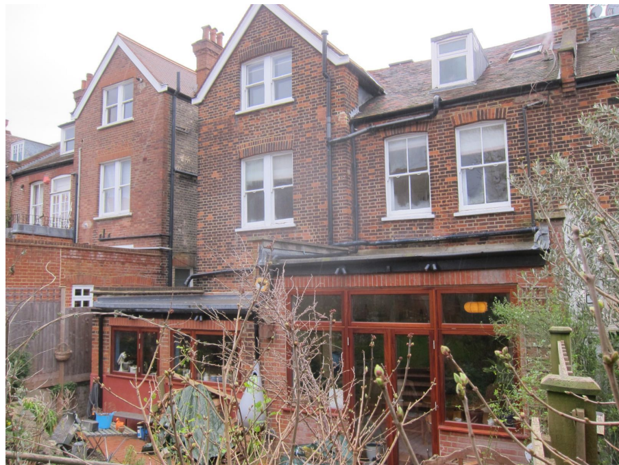
REAR VIEW OF ADJACENT PROPERTY AT NO 5 CREDITON HILL