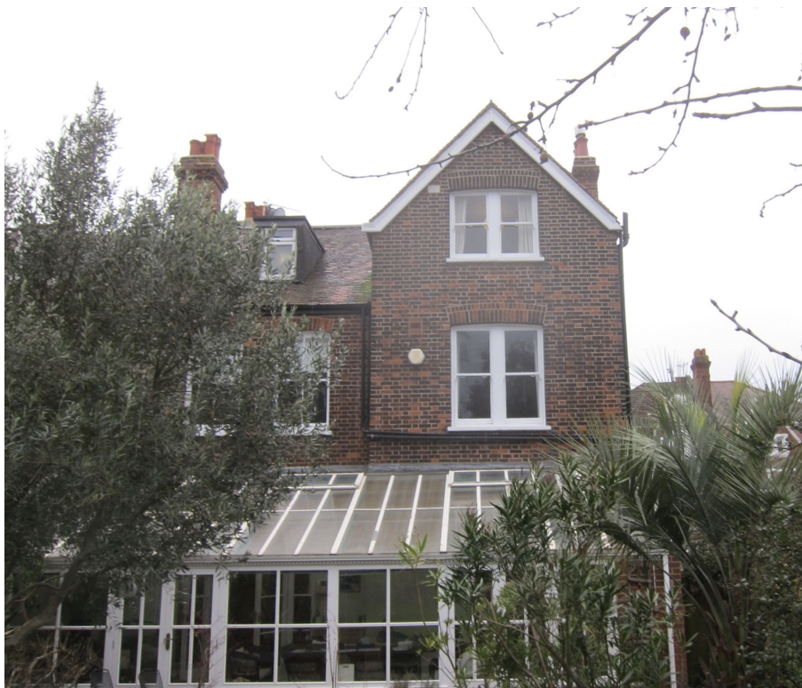
REAR VIEW OF NO 3 CREDITON HILL