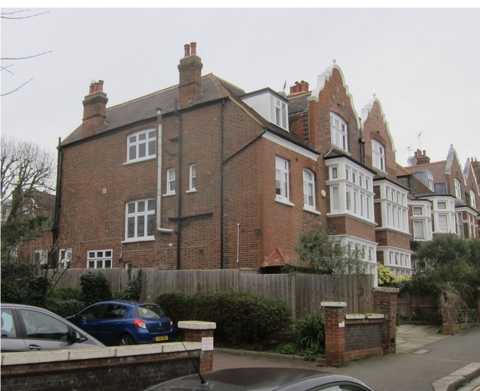
SIDE VIEW OF NO 3 CREDITON HILL SHOWING ADJACENT PROPERTY AT NO 5