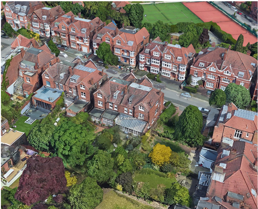
REAR AERIAL VIEW