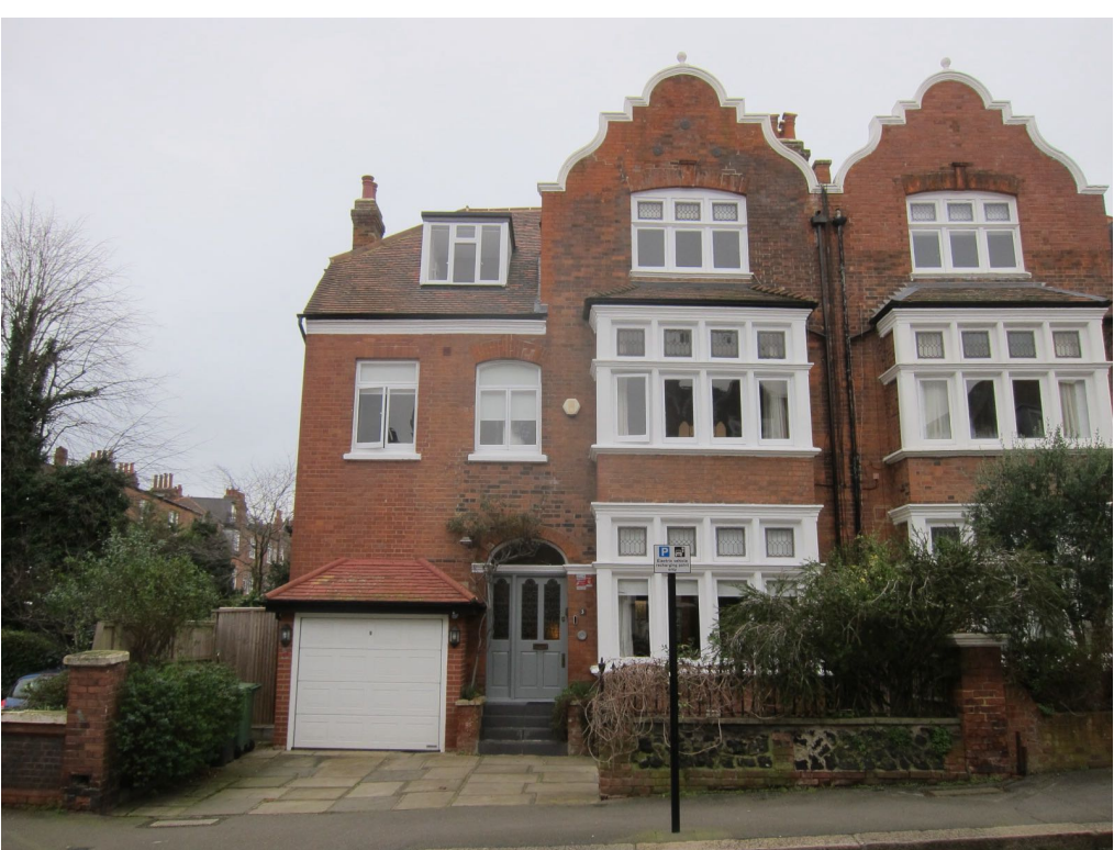
FRONT VIEW OF NO 3 CREDITON HILL