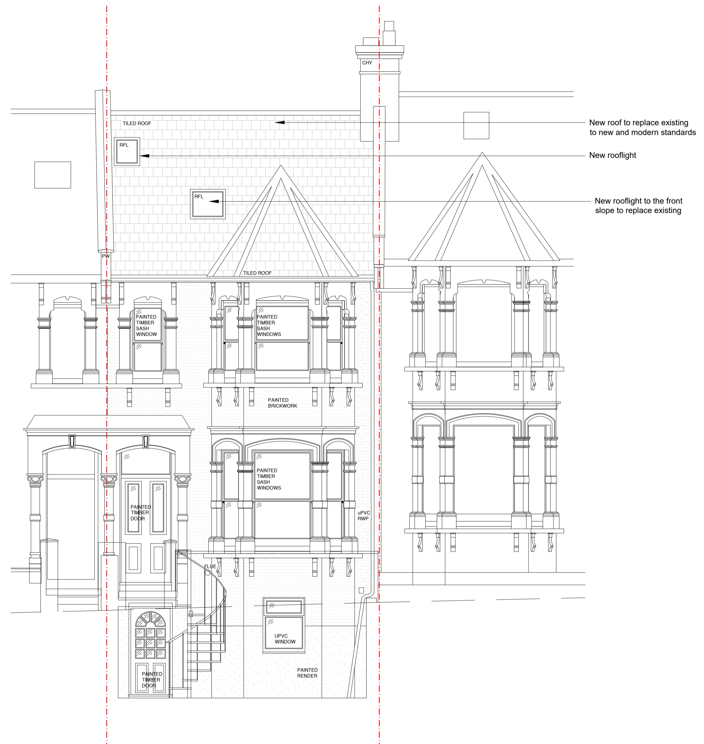
AA PROPOSED ELEVATION AA 0 0.5 1 2 3 4 5m 1:50