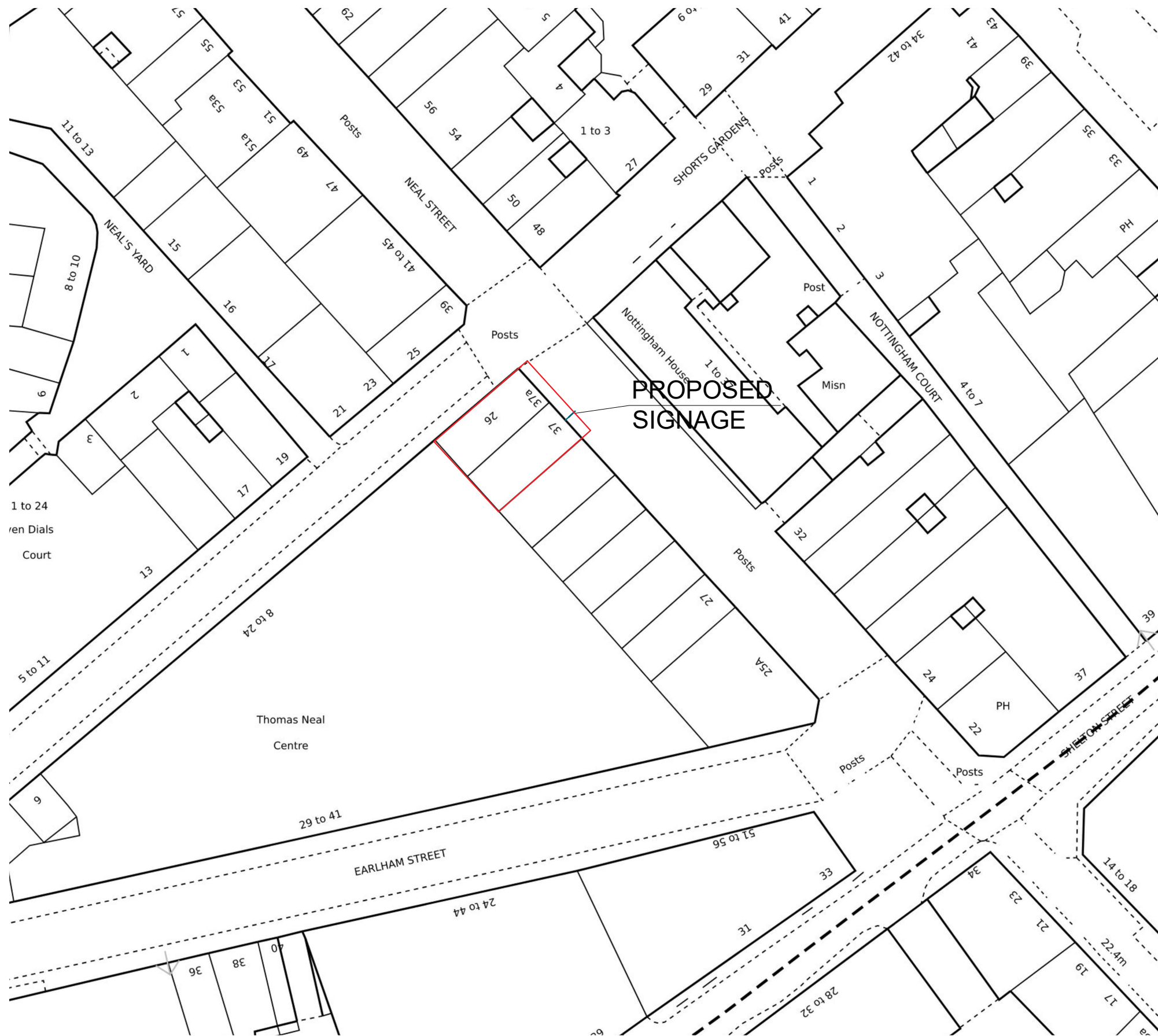
Proposed Block Plan

Any dimensions shown should be checked on site and discrepancies reported to the Architect prior to construction. Designs are not coordinated with engineer projects. Do not scale for construction purposes.