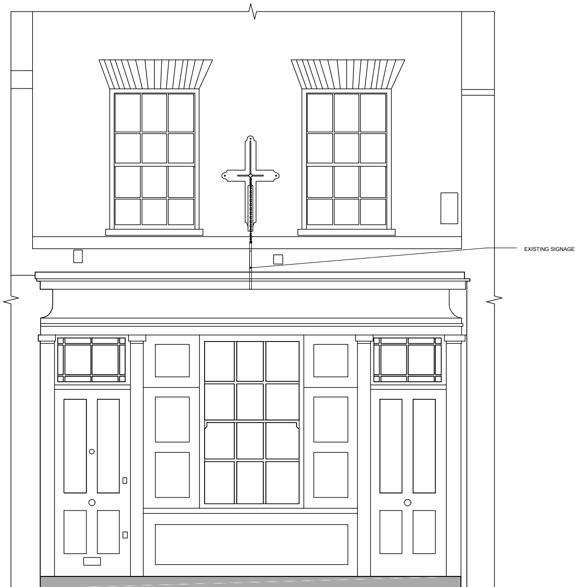
1 EXISTING SHOP EAST ELEVATION Scale: 1:50 @ A3