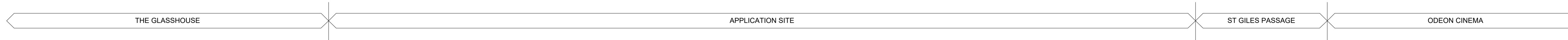
1 Proposed North Elevation Scale: 1:100