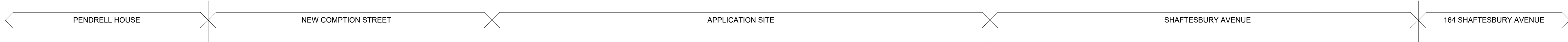
1 Proposed West Elevation Scale: 1:100