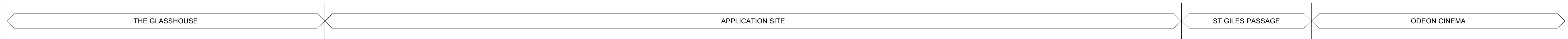
1 Existing North Elevation Scale: 1:100