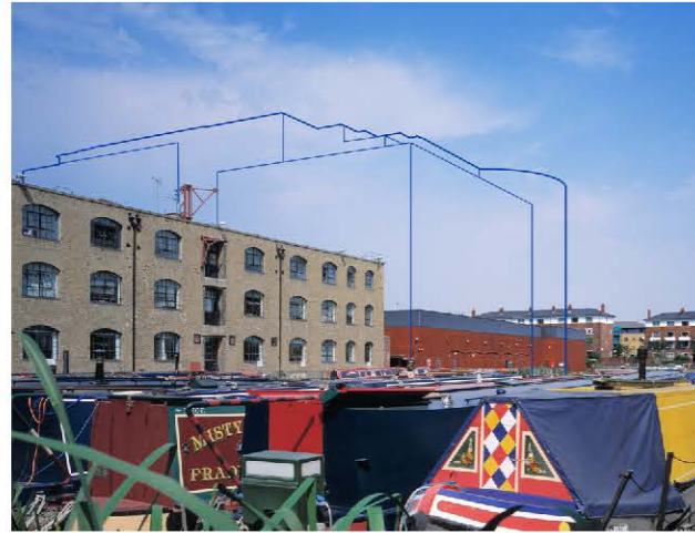
Example of AVR 1 confirming degree of visibility (in this case as an occluded 'wire-line' image)

A1.18 The purpose of a wire-line view is to accurately indicate the location and degree of visibility of the Proposed Development in the context of the existing condition and potentially in the context of other proposed schemes.