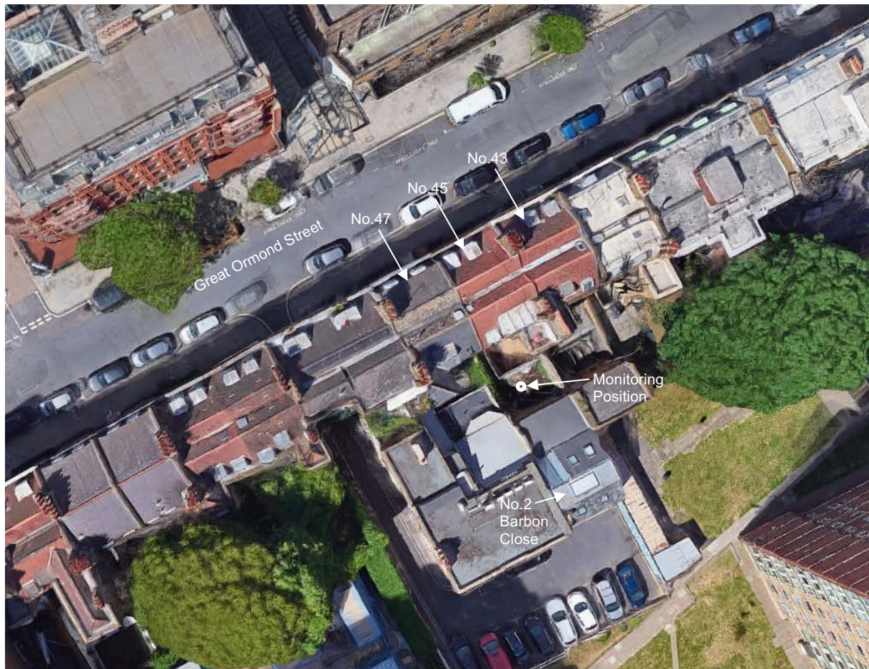
Figure 1: Aerial image of area around site