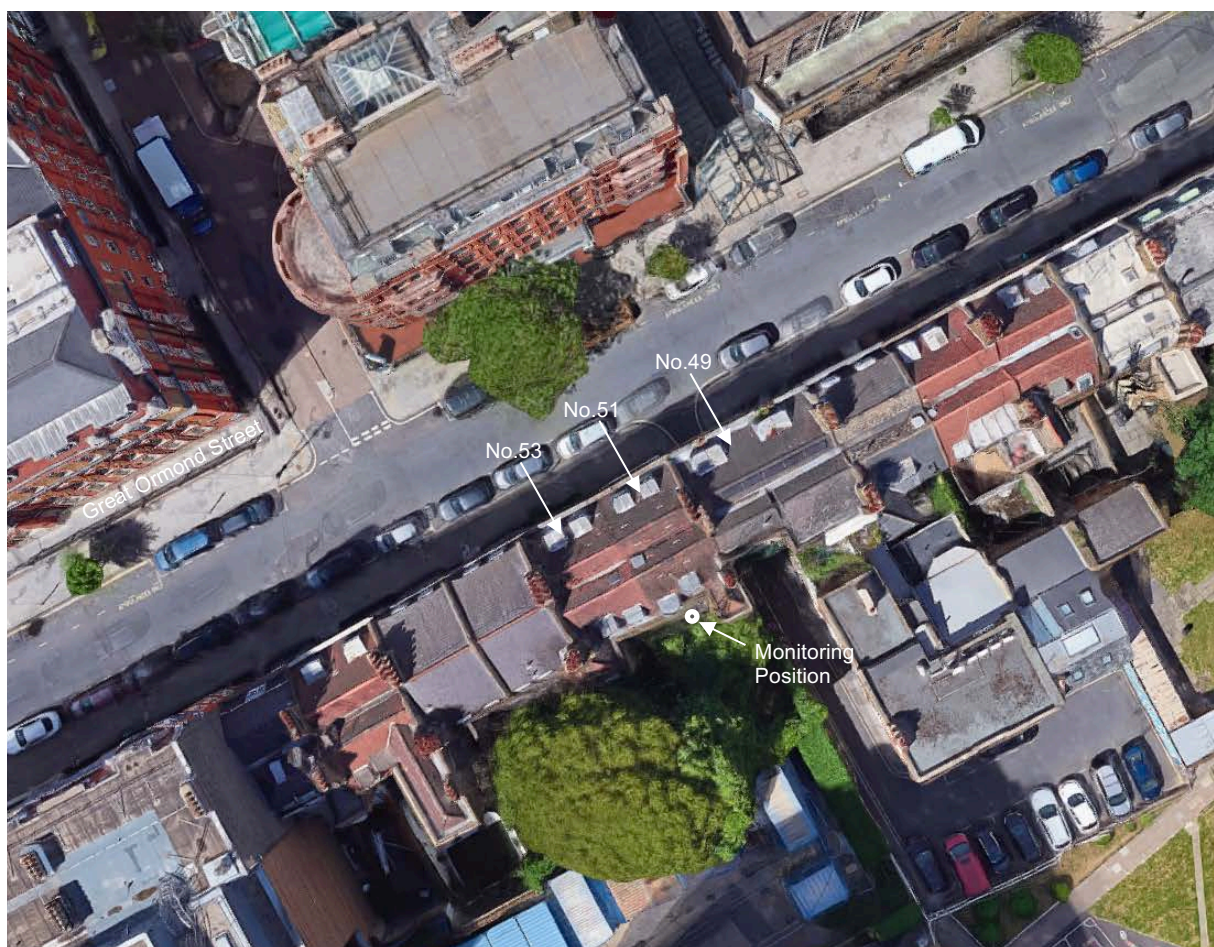
Figure 1: Aerial image of area around site