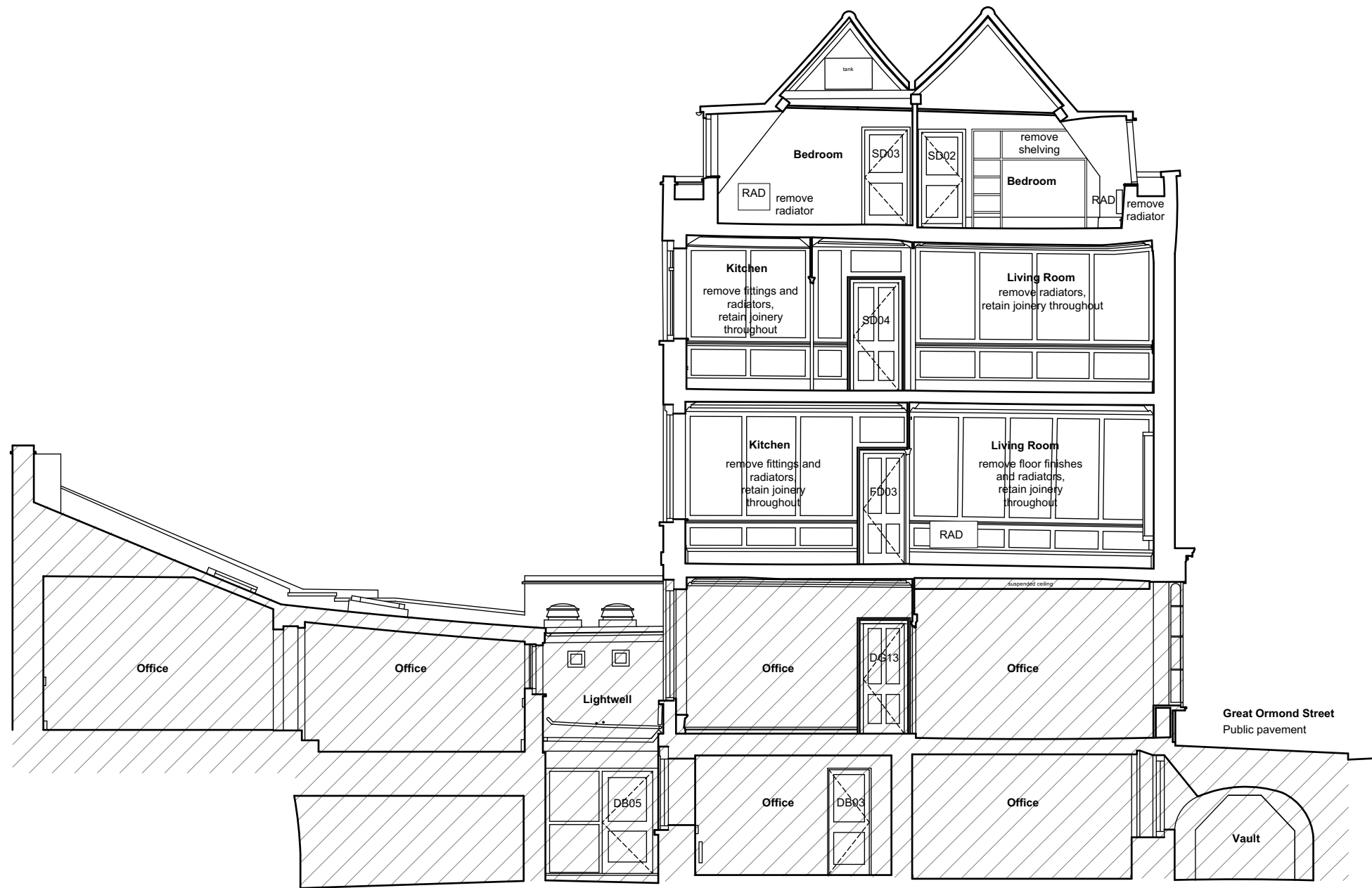
01 Existing Section B 006 1:100@A3; 1:50@A1