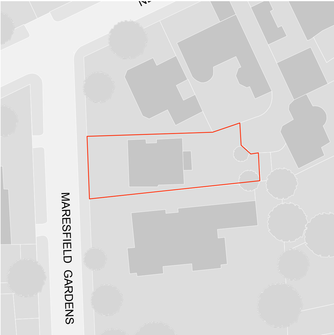
2 Site Plan 1:500