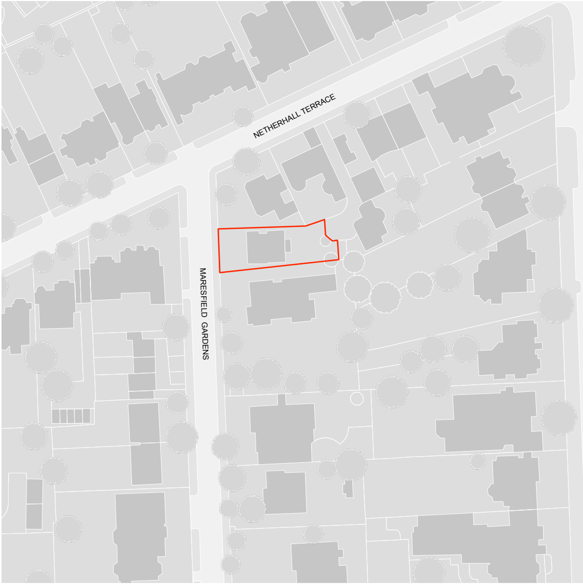
1 Location Plan 1:1250