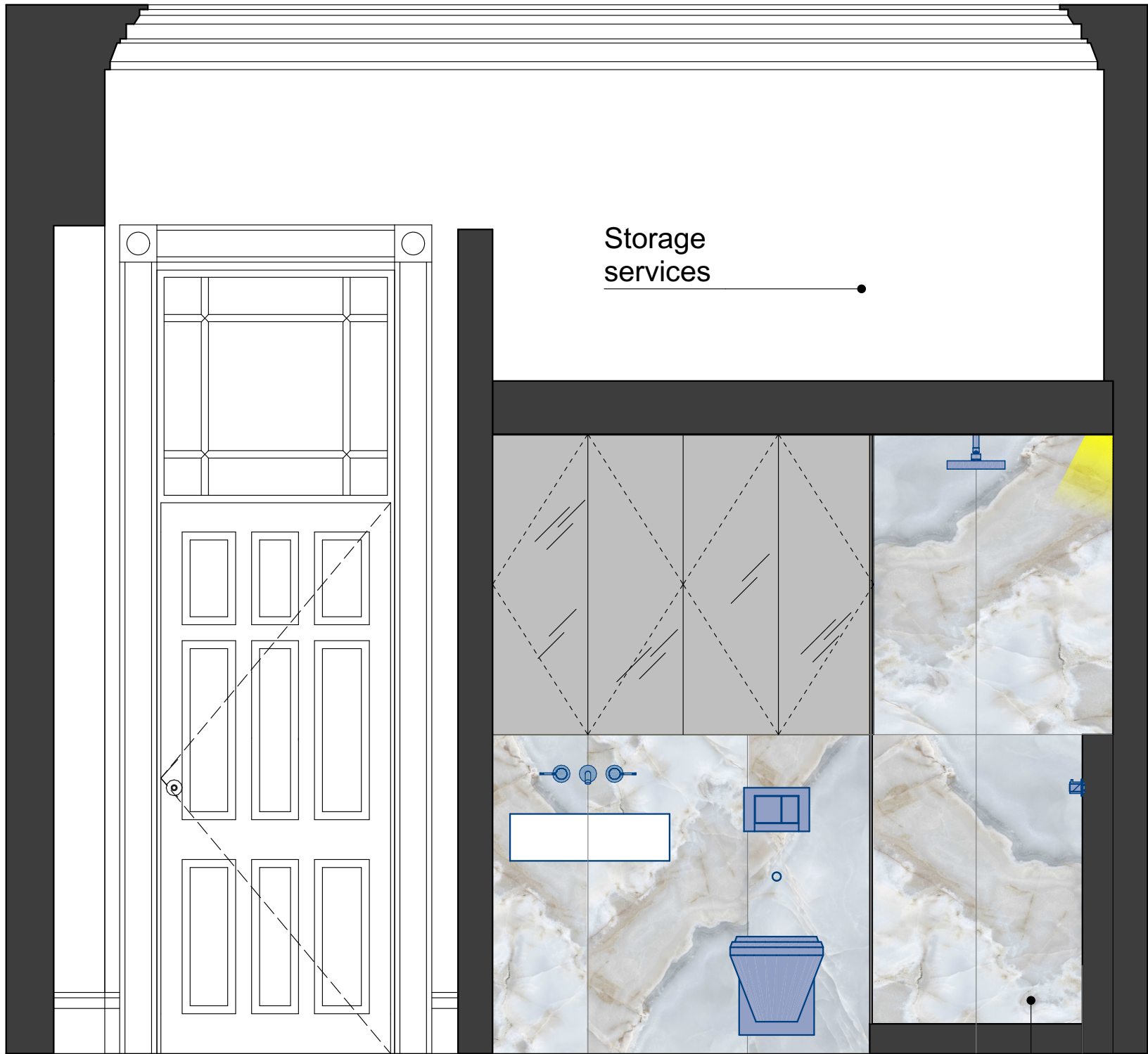
15 PROPOSED SECTION F-F. SCALE 1:20@A3 Elevated floor level in the shower area for the installation of a shower tray and pipe passage.