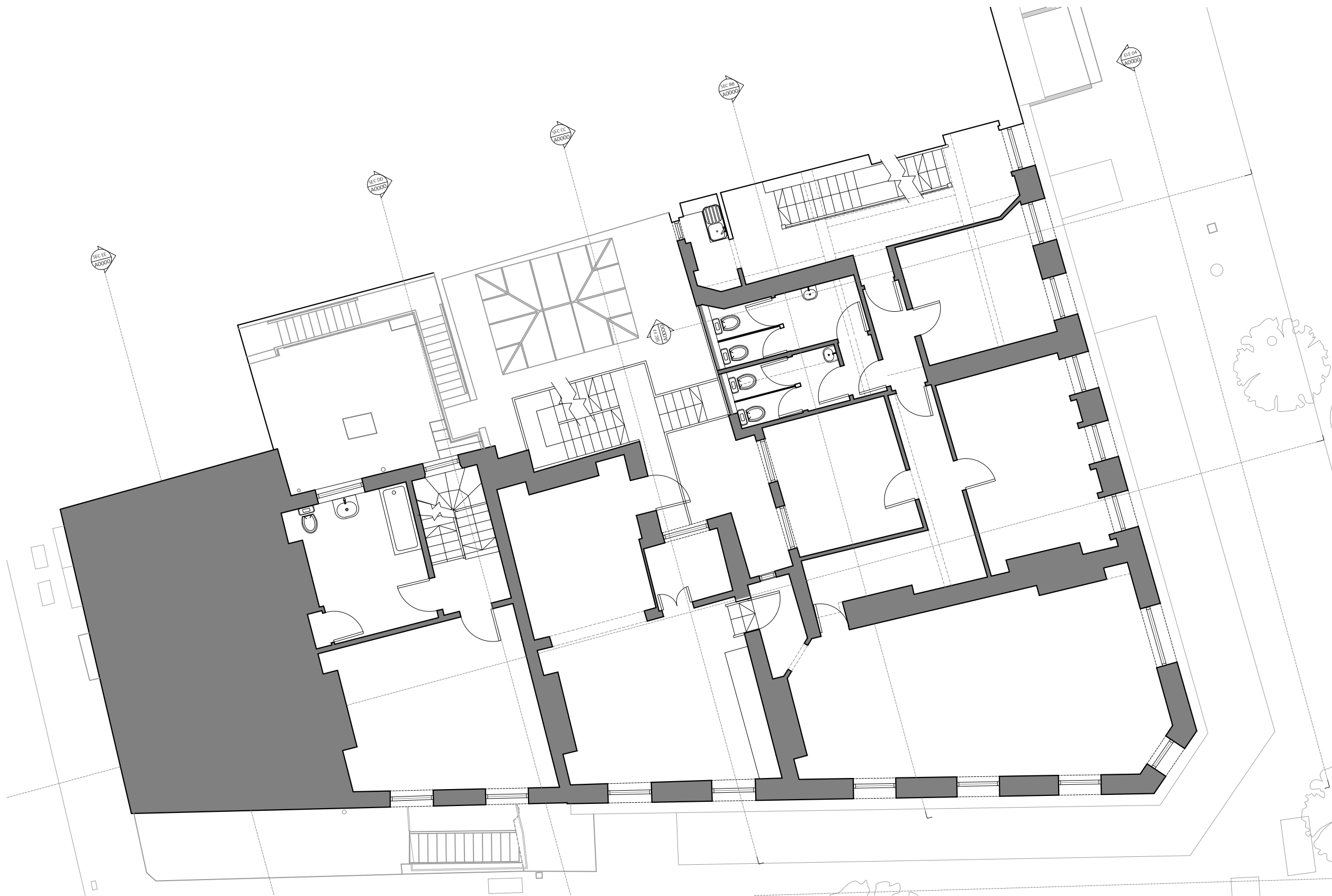
01 Existing Second Floor Plan 1:100