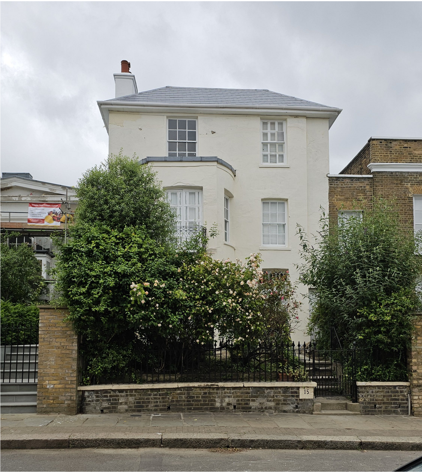
15 Downshire Hill - Front elevation view