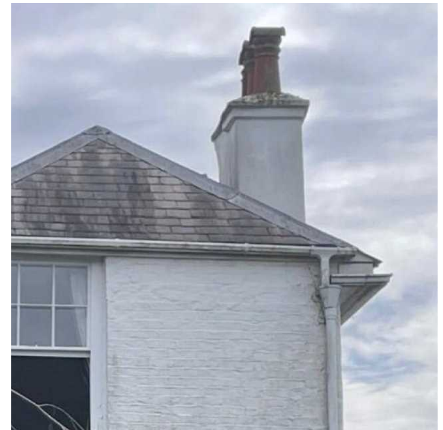
Pre-Existing Roof Profile

Code 5 lead flashing and ridge New interlocking slate tiles New square gutter Renewed soffit board with ventilation gaps