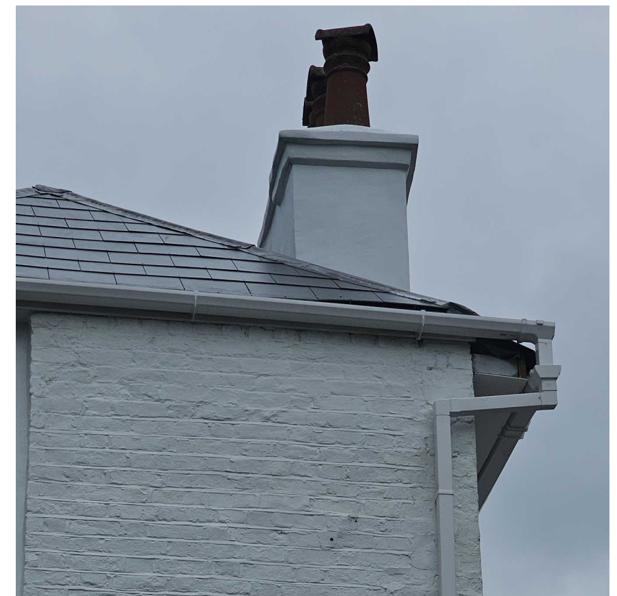
Existing Roof Profile