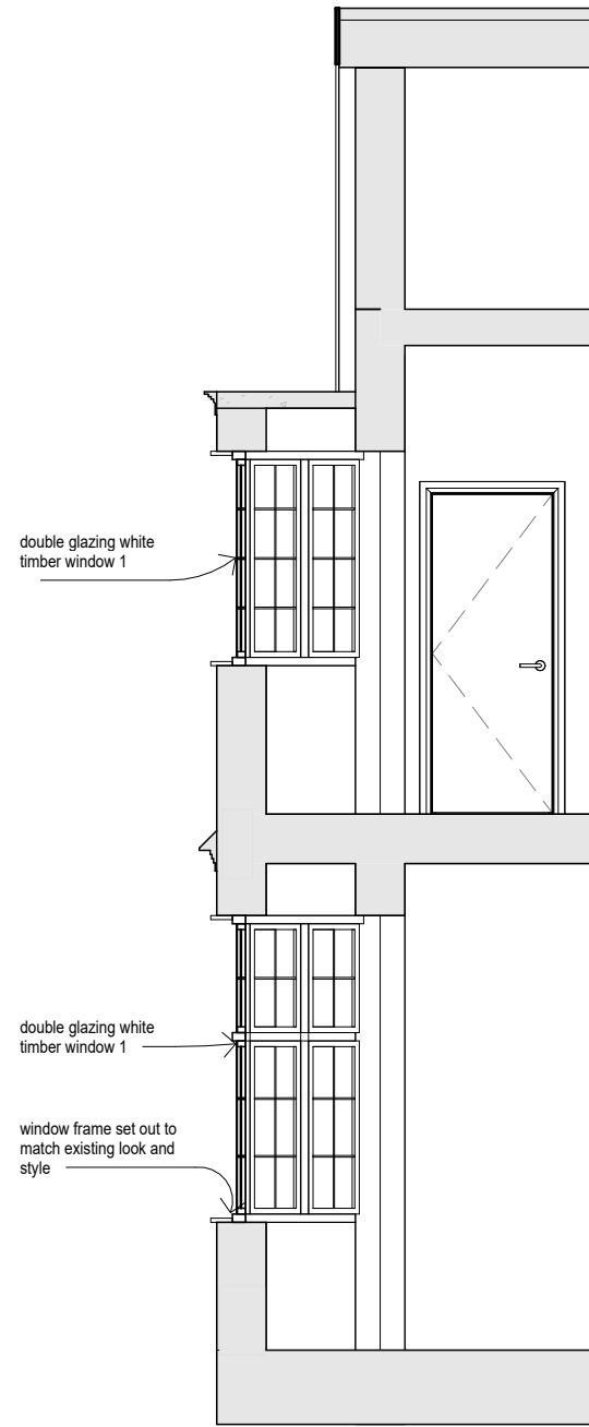
Section A-A scale 1:50

NOTE: to be read in conjunction with "240603 _ Heritage statement "