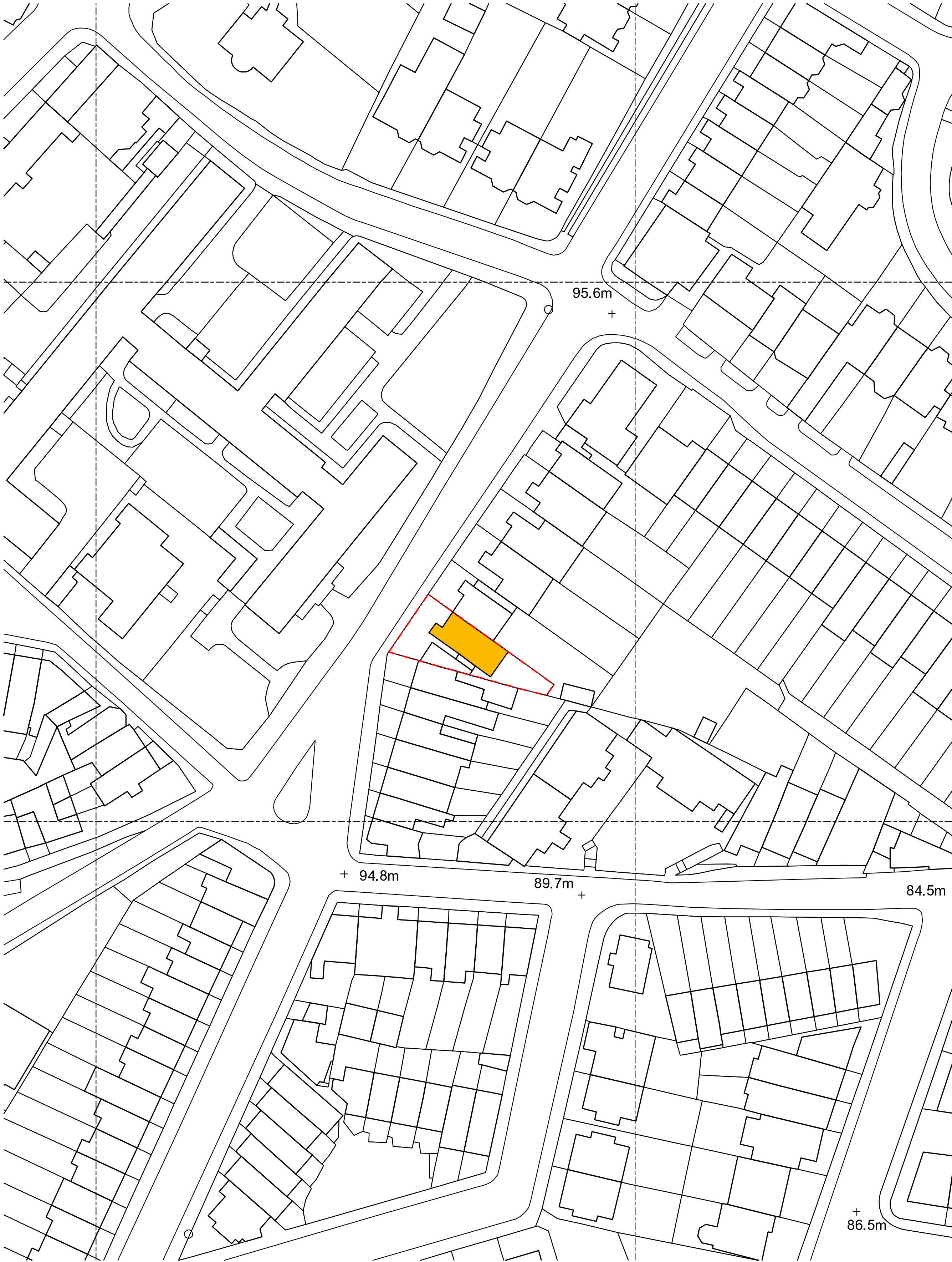
1 1:500 LOCATION PLAN