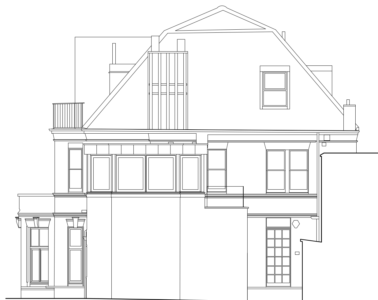
NORTH WEST ELEVATION AS PROPOSED