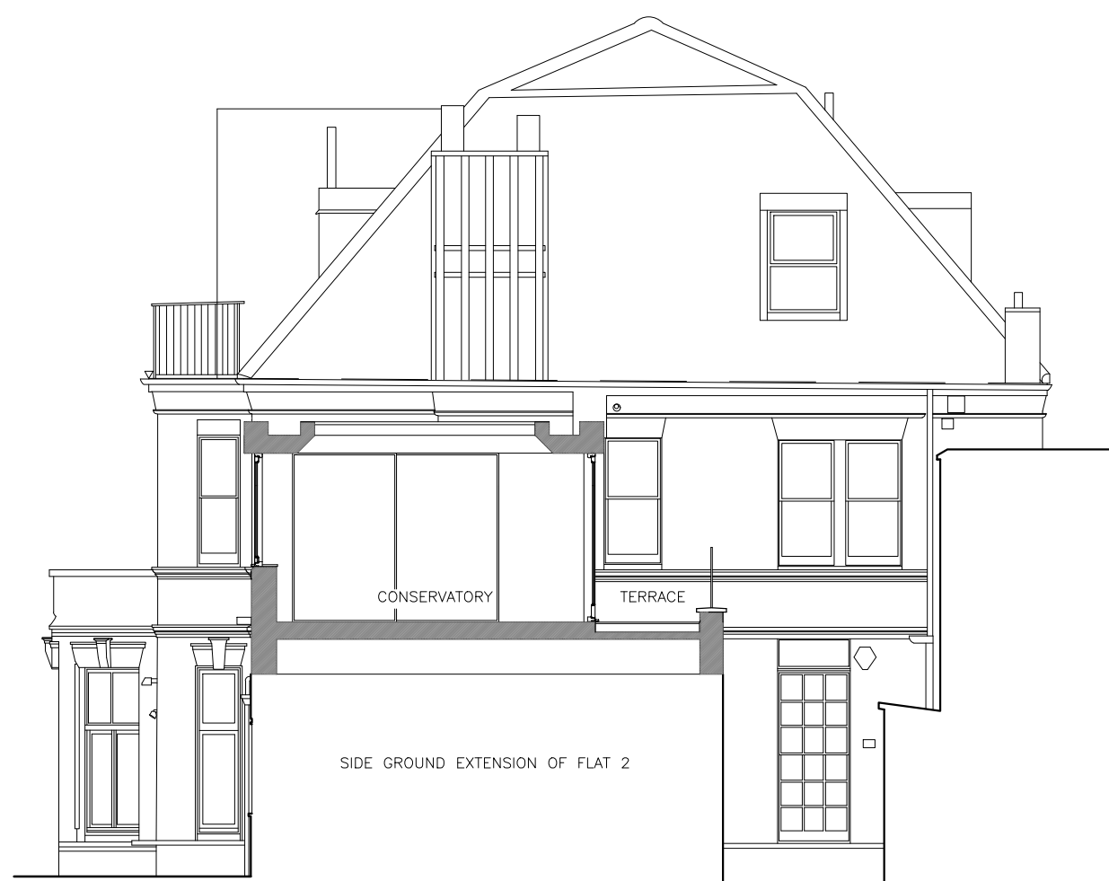
SECTION A-A AS PROPOSED