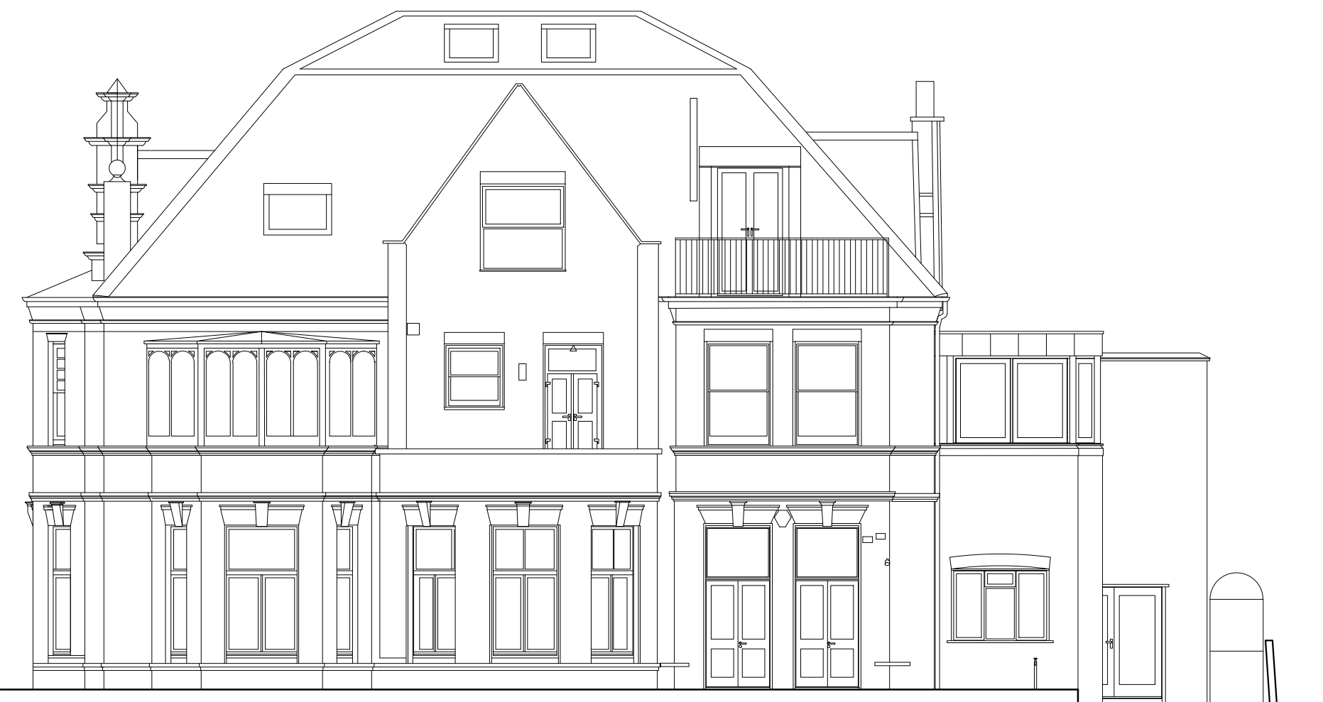
NORTH EAST ELEVATION AS PROPOSED