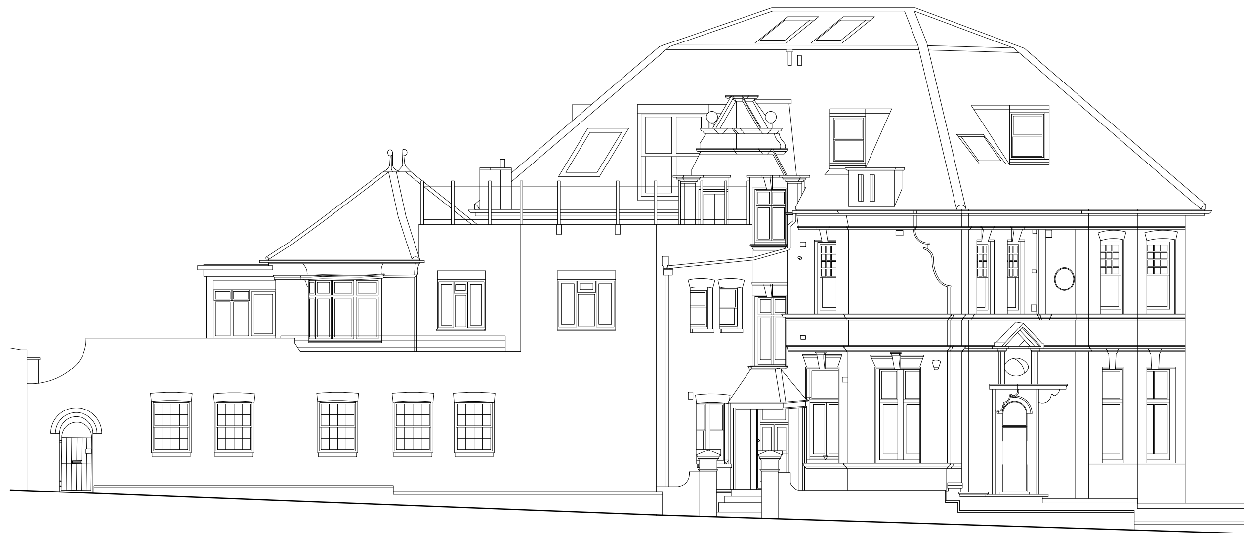
SOUTH WEST ELEVATION AS PROPOSED (ALONG AKENSIDE ROAD) EXTERNAL AREAS OF FIRST FLOOR FLAT 5 NOT VISIBLE FROM PAVEMENT STREET LEVEL