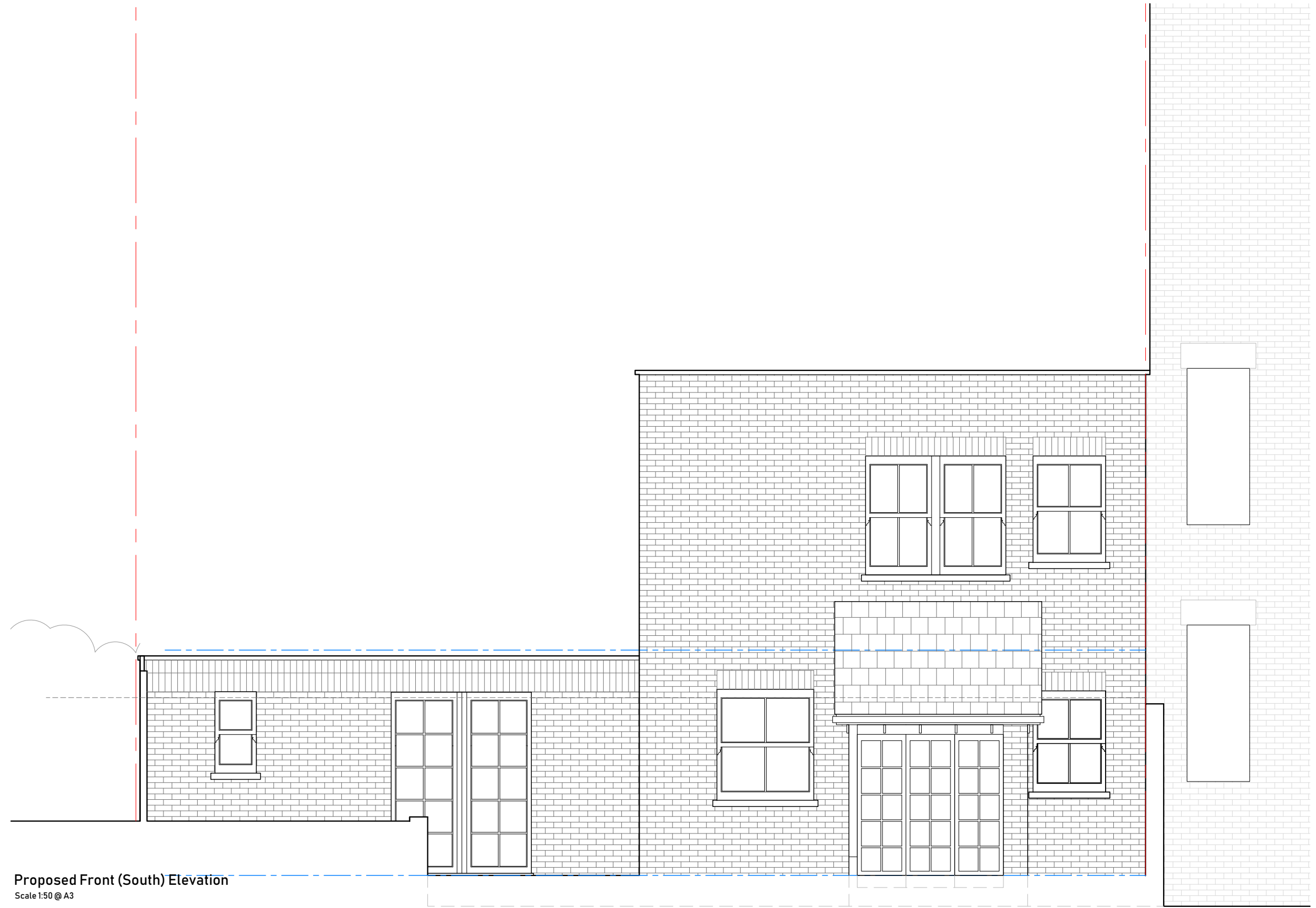
Proposed Front (South) Elevation