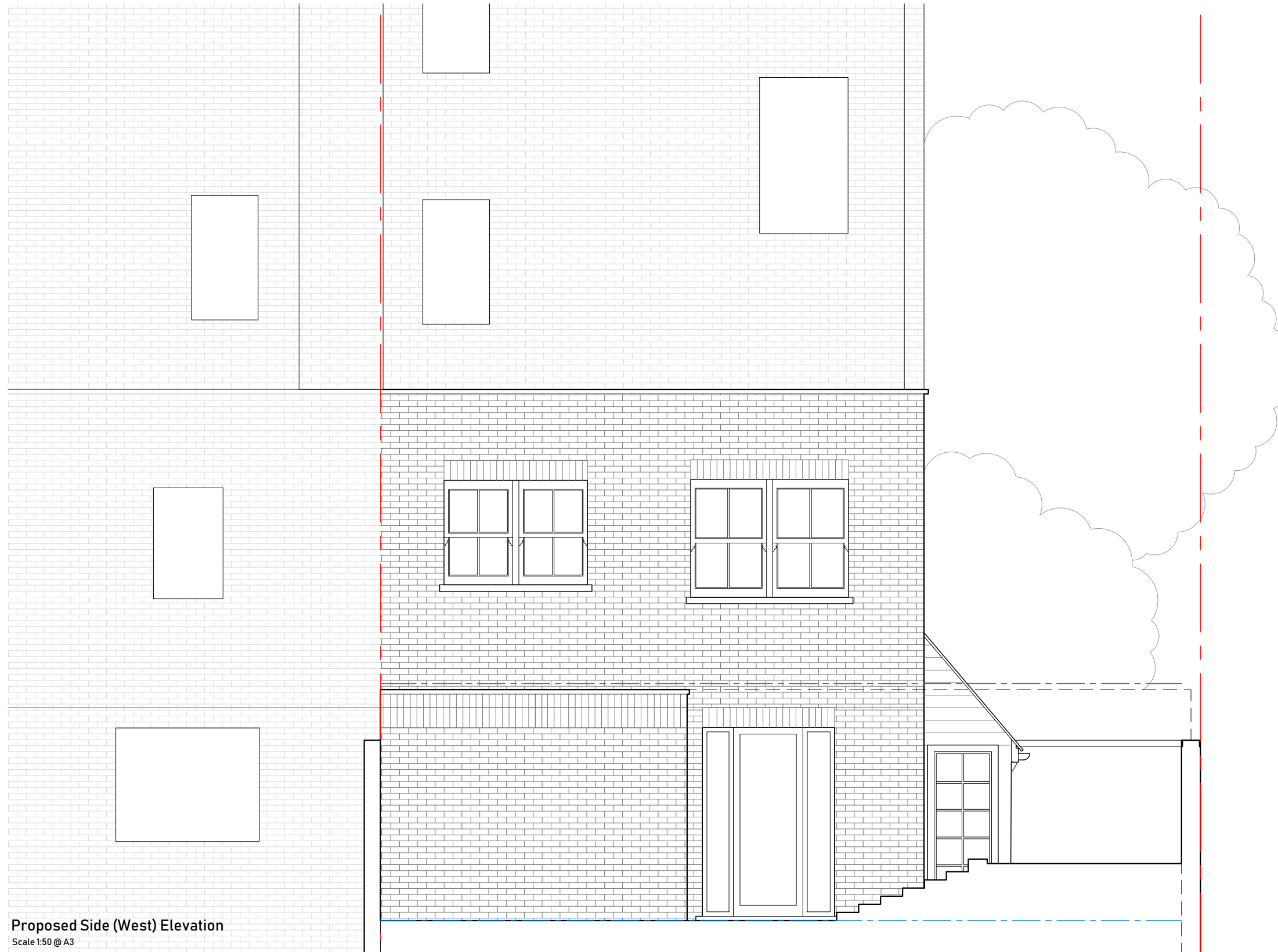
Proposed Side (West) Elevation