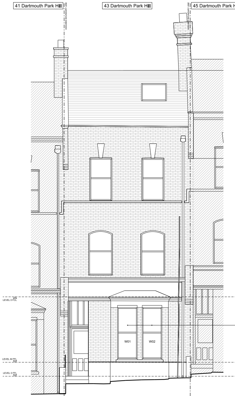
1. PROPOSED FRONT ELEVATION E-E