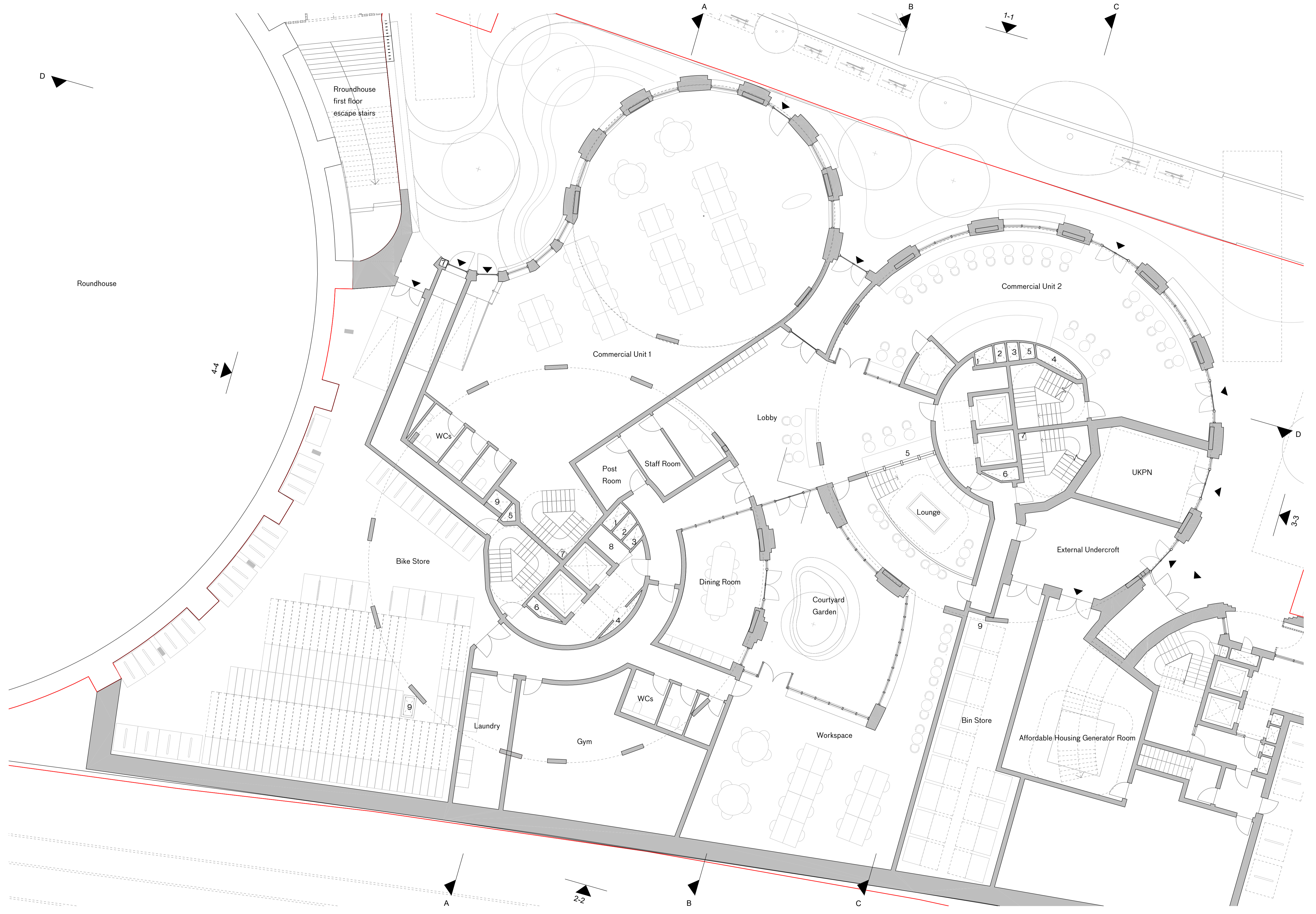
PBSA Ground Floor Plan