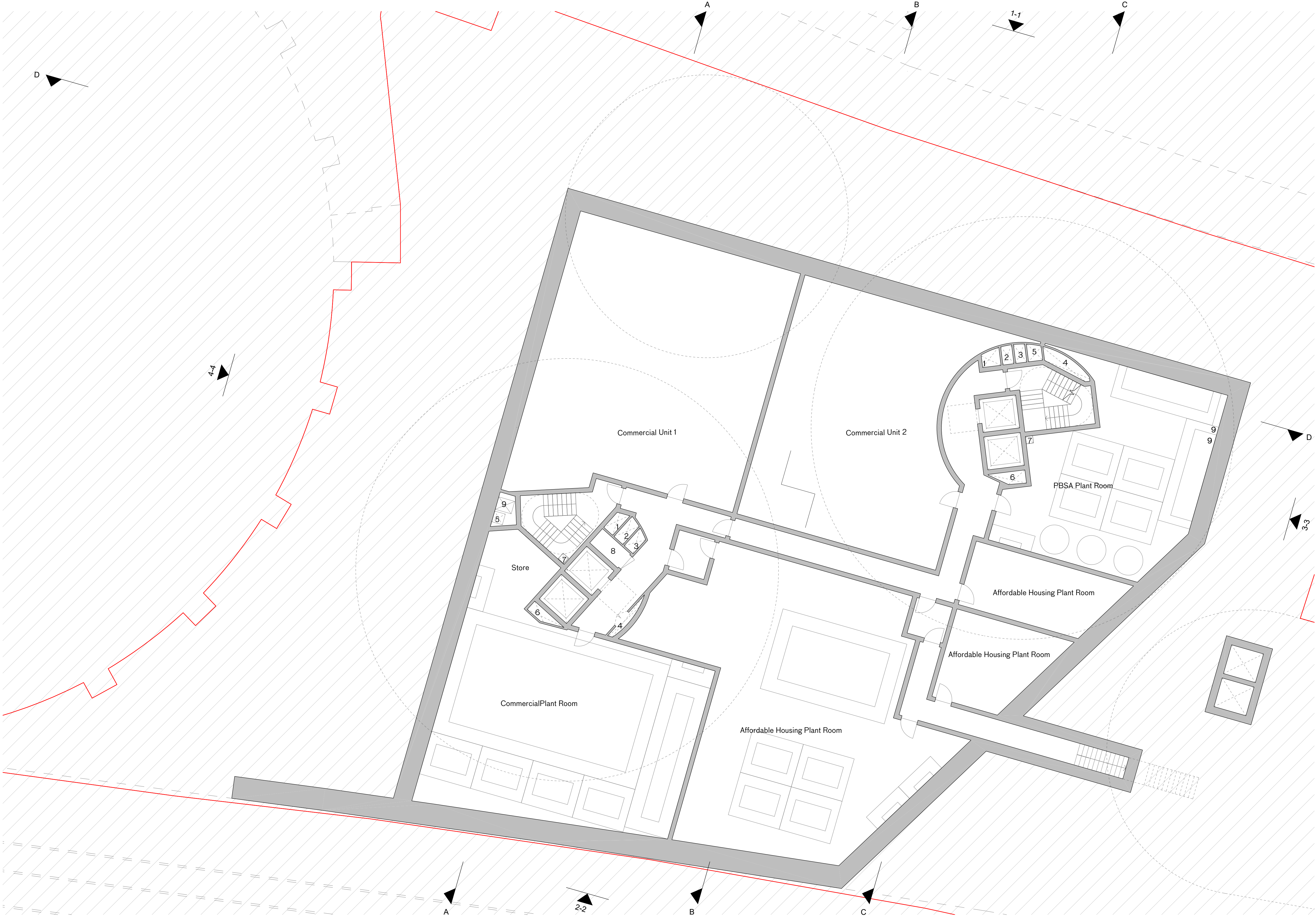
PBSA Basement Floor Plan