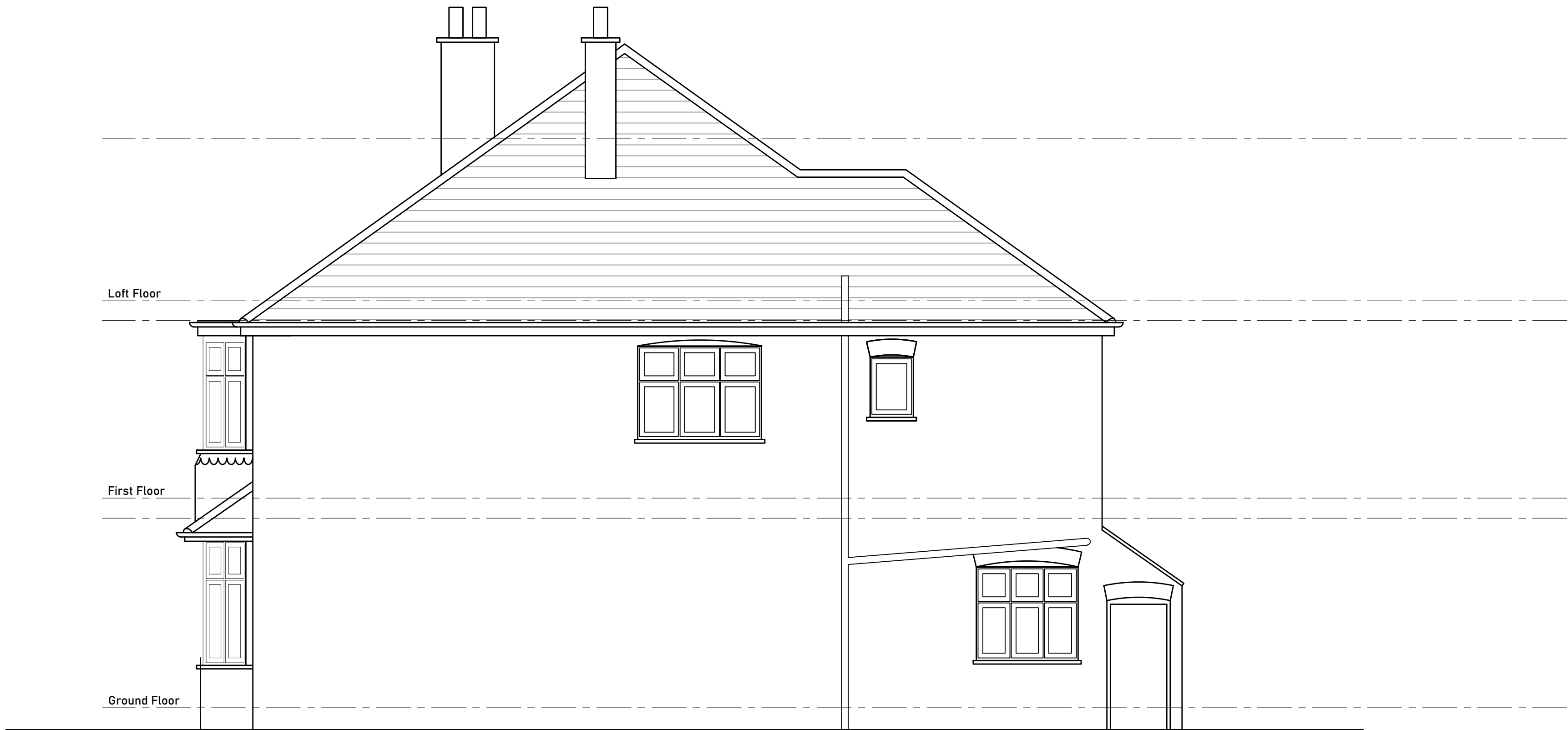
SIDE ELEVATION - EXISTING scale 1:50