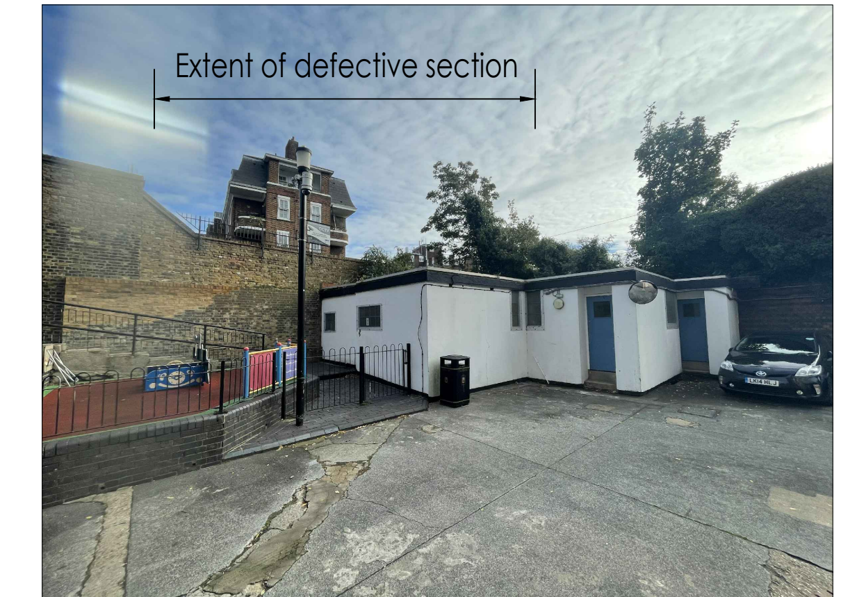
Existing Boundary Wall - View from Denyer House