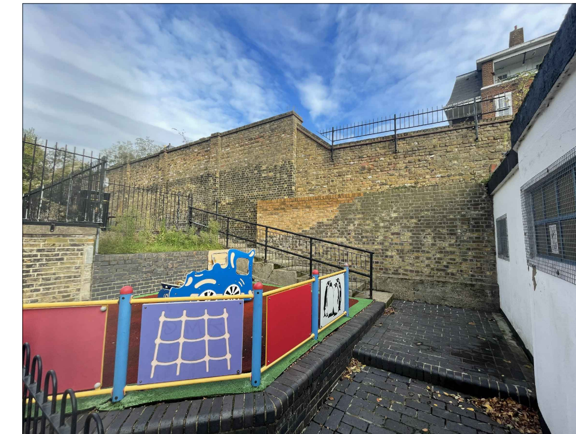
Existing Boundary Wall - View from Denyer House