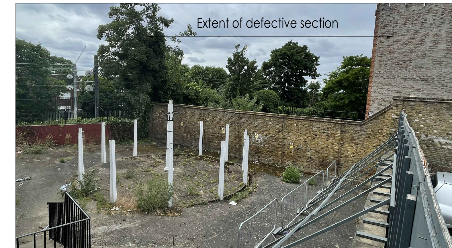
Existing Boundary Wall - View from Stephenson House