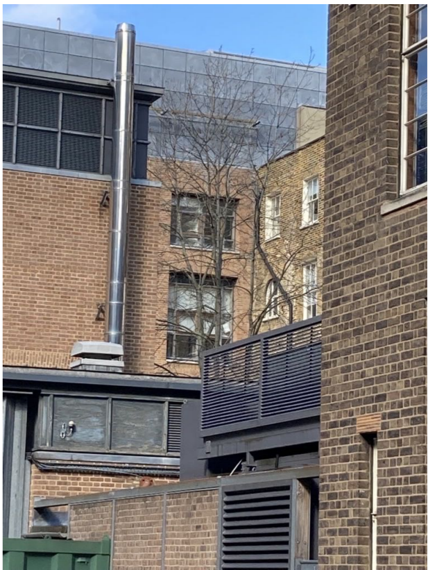
PHOTO OF THE EXISTING ELEVATION