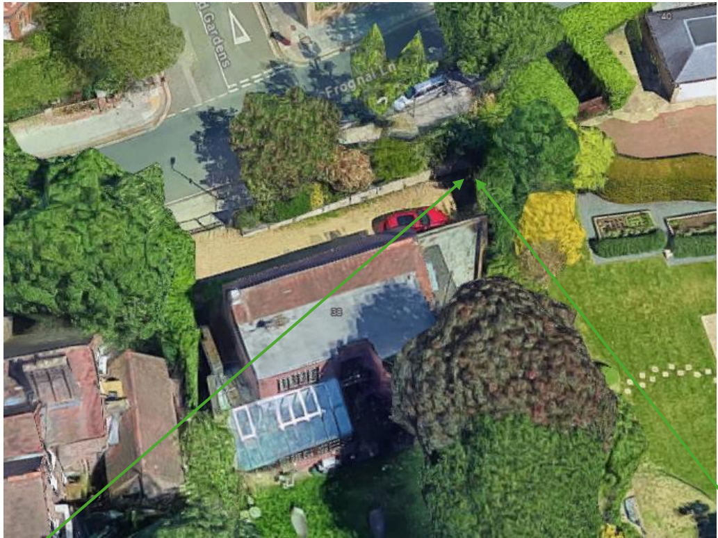
Existing Google Aerial Image