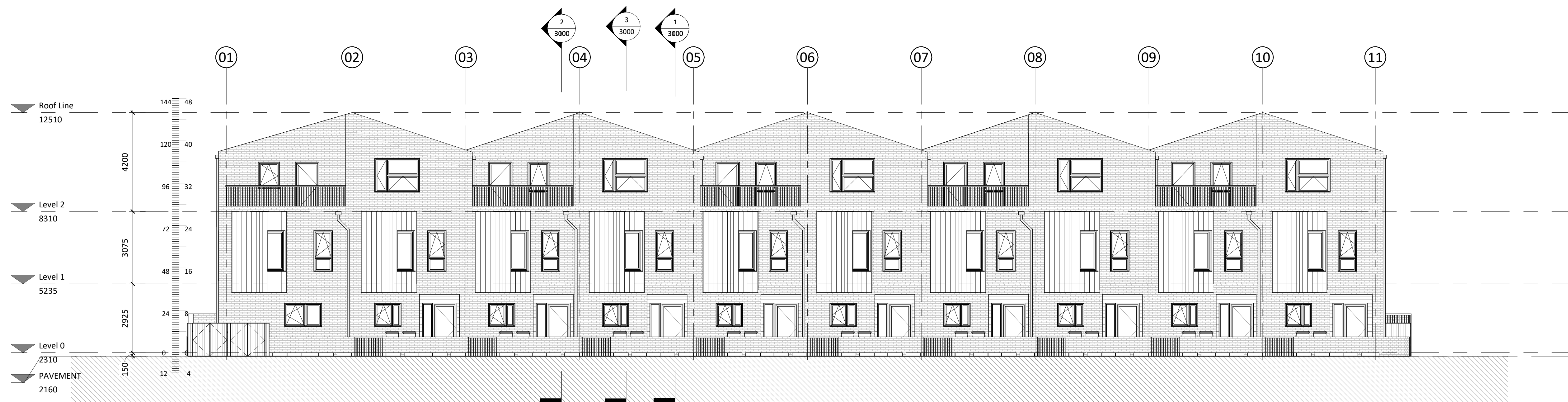
1 GA SOUTH ELEVATION 1 : 100

-THIS DRAWING SHALL NOT BE SCALED. -ALL DIMENSIONS SHALL BE CHECKED ON SITE PRIOR TO COMMENCING THE WORKS AND ERRORS AND OMISSIONS TO BE REPORTED TO THE ARCHITECTS. -ALL WORKS SHALL CONFORM TO THE CURRENT EDITION OF THE BUILDING REGULATIONS AND OTHER STATUTORY REQUIREMENTS. -ALL MATERIALS AND WORKMANSHIP SHALL CONFORM WITH THE RELEVANT BRITISH STANDARD SPECIFICATIONS AND CODES OF PRACTICE. -ALL DIMENSIONS ARE IN mm UNLESS OTHERWISE STATED. -THESE DRAWINGS ARE TO BE READ IN CONJUNCTION WITH THE EMPLOYERS REQUIREMENTS & DESIGN SPECIFICATION AND ALL OTHER RELEVANT CONSULTANTS DRAWINGS. -ALL PRODUCTS SPECIFIED ON THIS DRAWING MUST BE INSTALLED IN ACCORDANCE WITH THE MANUFACTURERS' INSTRUCTIONS, RELEVANT BRITISH AND EUROPEAN STANDARDS CODES OF PRACTICE AND RELEVANT BBA CERTIFICATES.