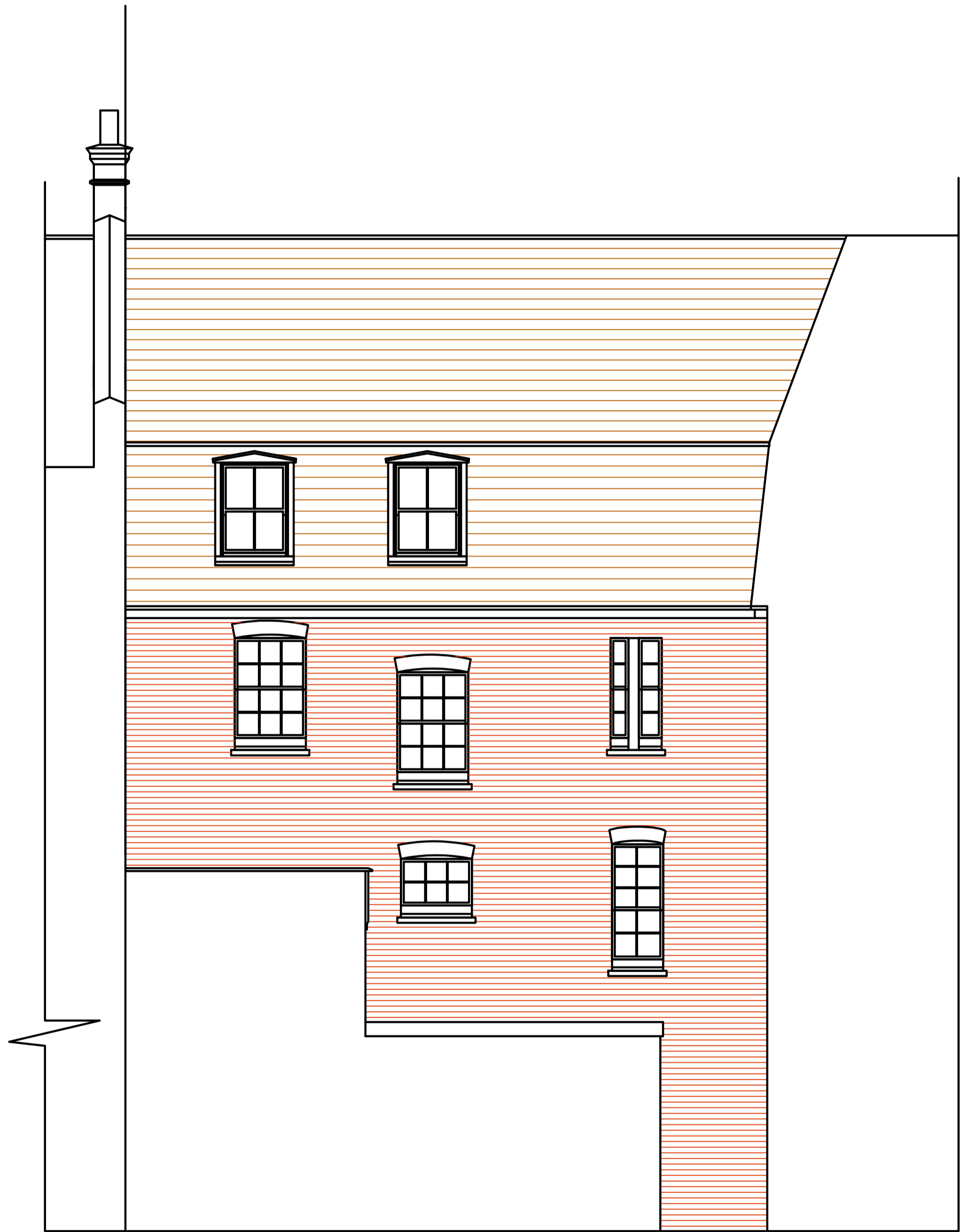
SOUTH WEST ELEVATION THROUGH LIGHT WELL