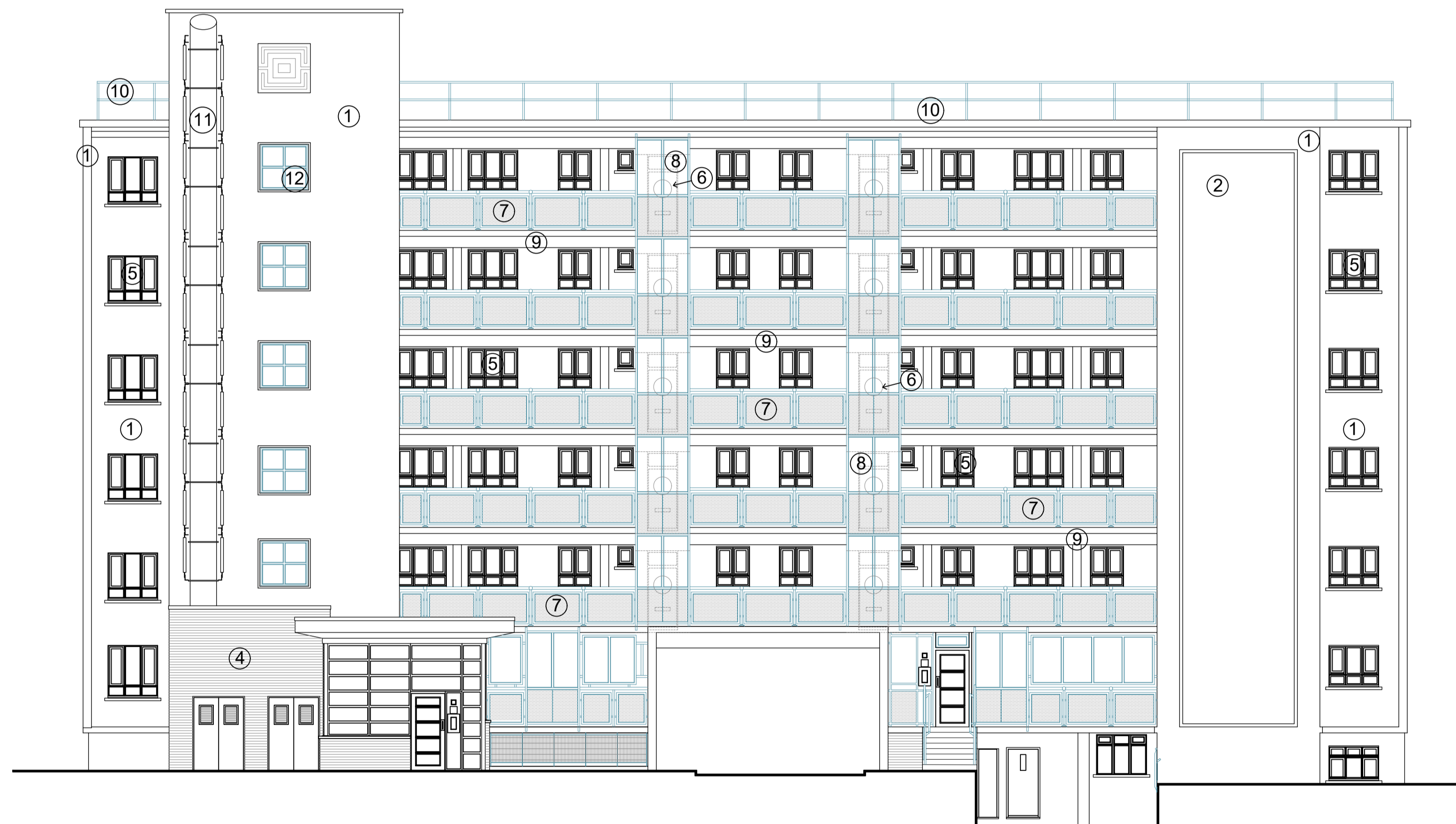
Riverfleet - Elevation A (North West)